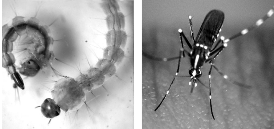
PLATE 1. Nonnative, container-dwelling mosquitoes of the southeastern United States. (Left) Fourth-instar larvae of Aedes albopictus (on right) and Aedes aegypti . These species co-occur in man made containers in South Florida, and interspecific competition among larvae can be intense. (Right) An adult female Aedes albopictus taking a blood meal.

southern United States by the time A. albopictus arrived (Tabachnick 1991). Aquatic larvae and pupae of both species occur in man-made and natural water-filled containers such as tires, vases, and tree holes. Larvae feed on microorganisms in the water column and on surfaces (Christophers 1960, Hawley 1988).