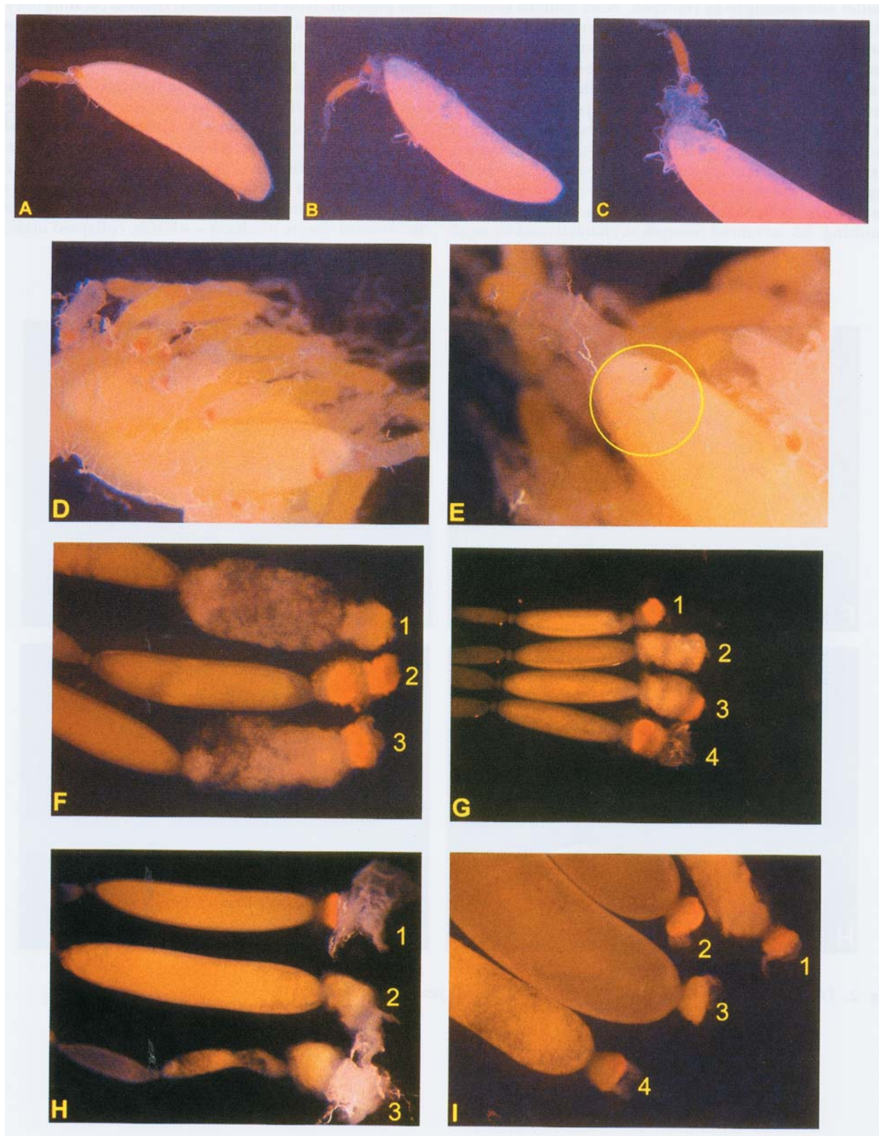
Plate I. Ovulation and formation of follicle resorption bodies in R. microptera .