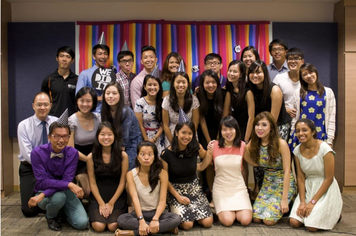
14. Group photo