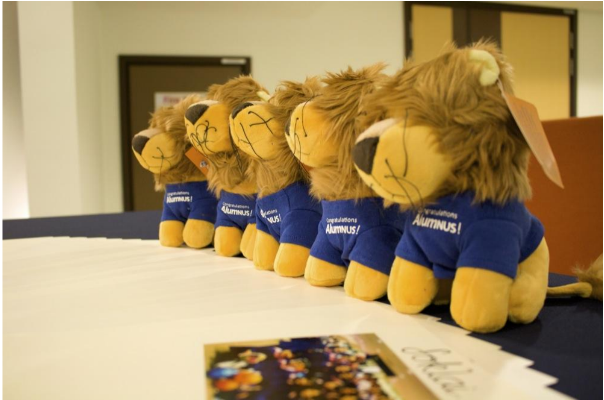
2. Linus Soft Toys provided by Office of Student Affairs