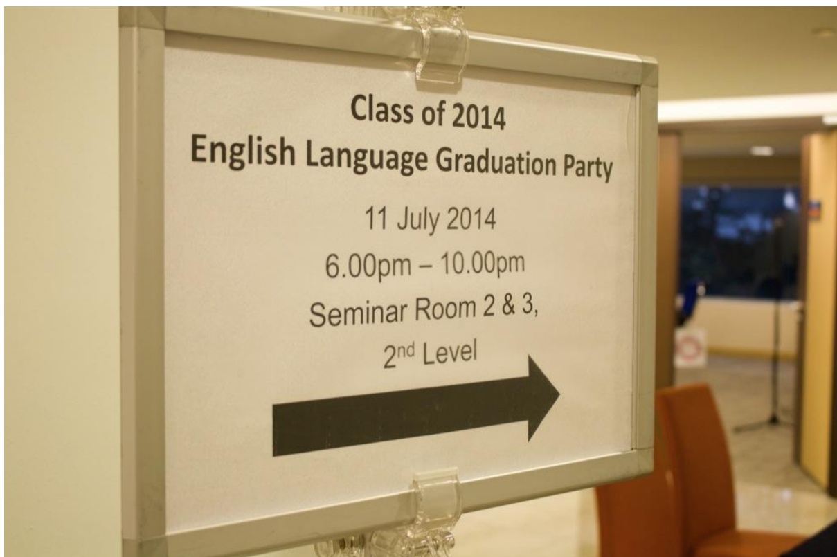
1. Signage provided by SFAH staff