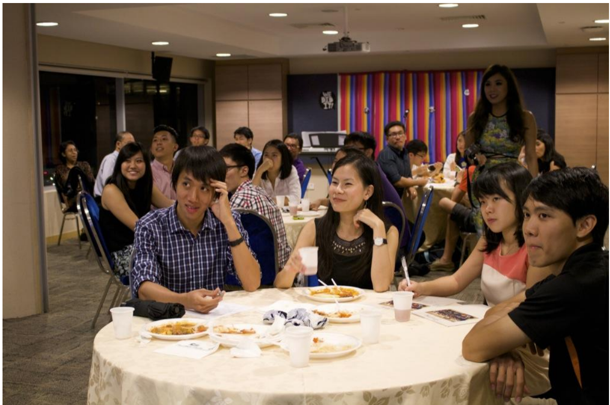
9. Intent on the screen for the pub quiz