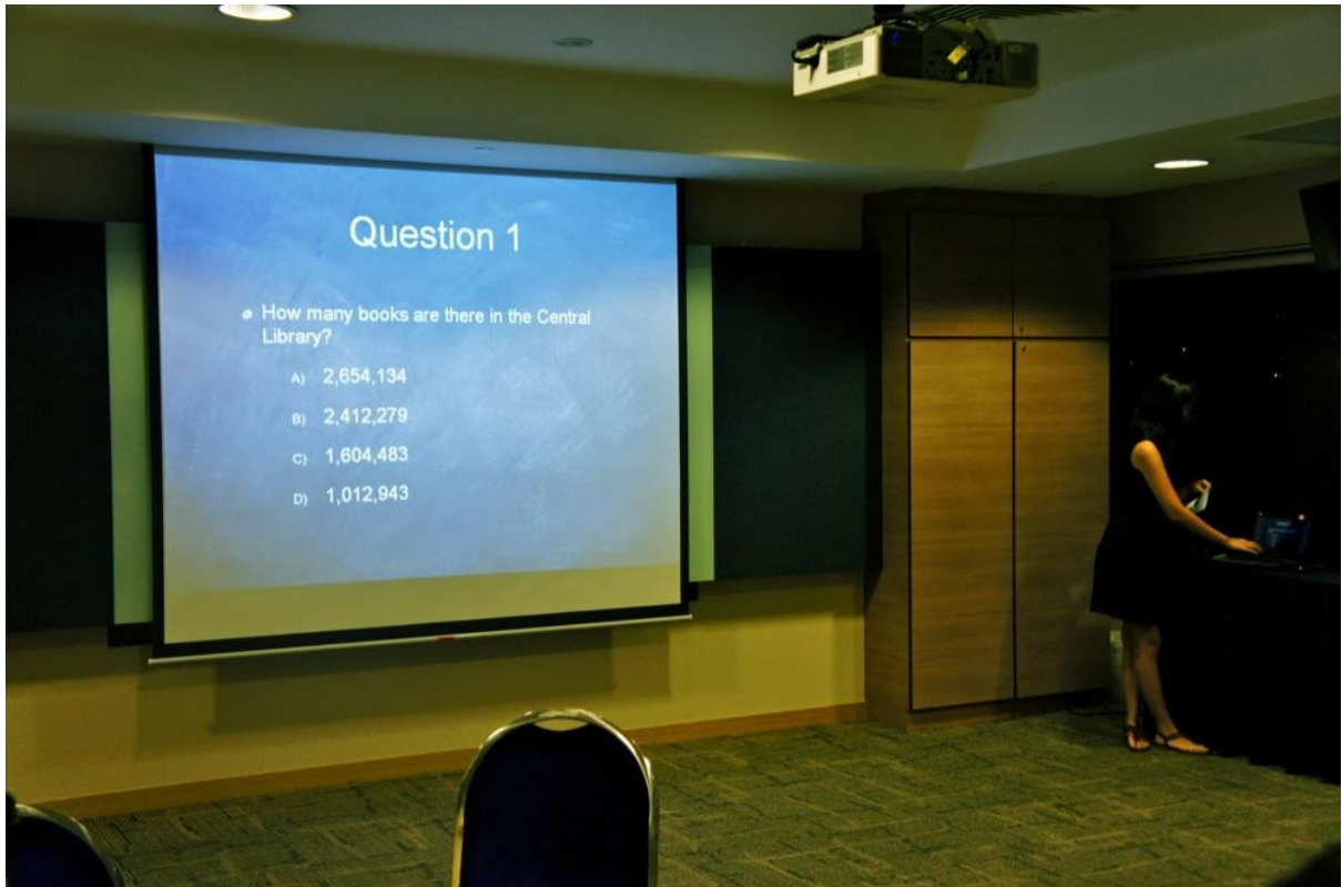
6. Pub Quiz