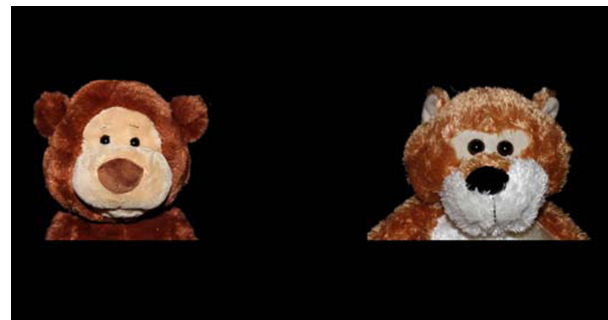
Figure 1. A photograph of the habituation stimuli.

F(1, 104) = 1.6, p = .2 ; or maternal education, F(1, 109) = .01, p = .91 (see Table 2 for descriptive statistics). Groups were comparable in terms of city of residence, relevant demographic characteristics, and ethnic composition.