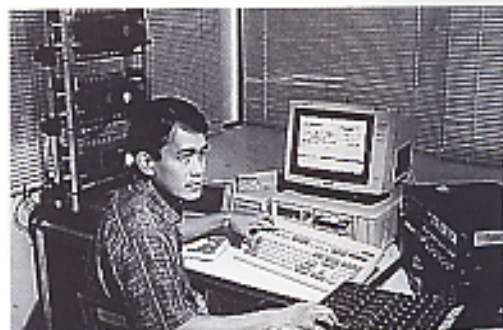
Multi-image slide programming.