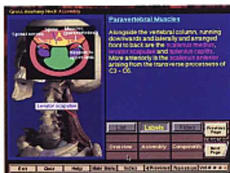
"Gross Anatomy", a joint project between Dr K. Rajendran from the Department of Anatomy, the Computer Centre and CDTL.

The packaging of a multimedia application can come in various forms. The current, most common form is CD-ROM. It can be mass-produced rather inexpensively and can hold large amounts of data (approximately 650-680 Mb). Large data storage is often necessary if the application includes video and sound clips. The Internet is also fast becoming another medium used for multimedia learning.