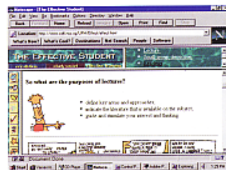
"The Effective Student" guide on the Web.