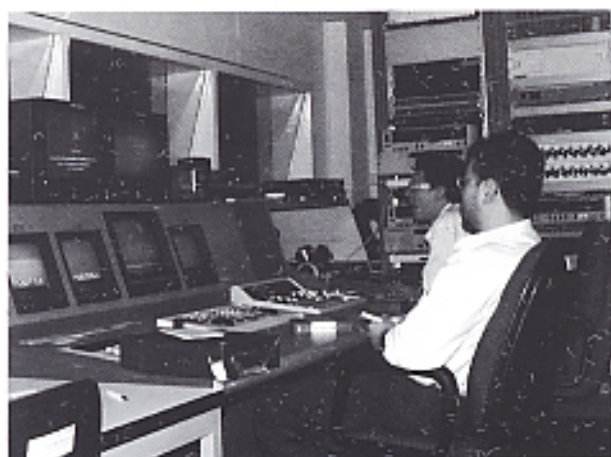
Video post-production editing.

To contribute to an environment conducive to reflective teaching practice, CDTL provides various platforms for discussion and experience-sharing. During the past year, monthly seminar and dialogue sessions were mounted on the following topics.