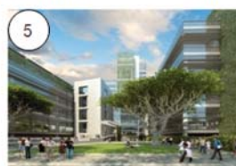
Campus for Research Excellence And Technological Enterprise (CREATE)