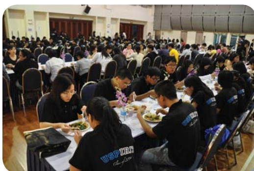
Residential dining experience for USP students

Given the tight timeline and heavy workload of university life, it is easy for students to