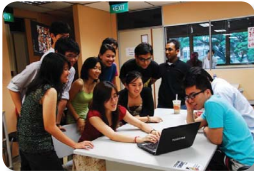
USP students at their student lounge aka Chatterbox

Second, students will learn a lot from each other. Again this will build upon what happens already. USP is quite blessed with space, and some of our spaces are given over to student use. The students who gather in Chatterbox, their lounge, do so to study, to relax, and above all, to talk. Much of that talk is intellectual in the broadest sense of the word. It addresses important questions and brings different perspectives to bear upon them.