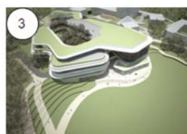
Education Resource Centre