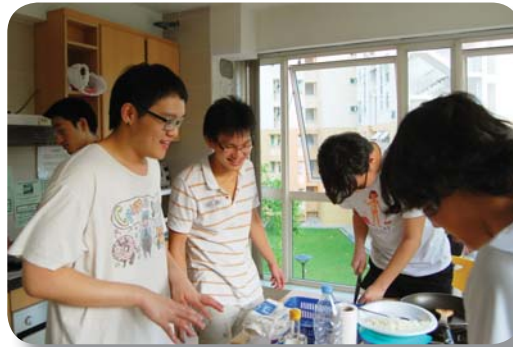
USP students learn to cook in the USP Residential Pilot

However, residential living is not without its caveats. The main challenge we face is that of cost. The introduction of state-of-the-art facilities and good-quality food also brings a price tag. As such, the requirements for a USP education as imagined have also changed. Previously, prospective students and their parents could evaluate the viability of pursuing