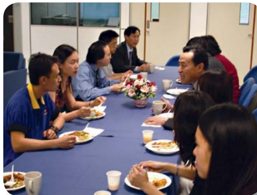
Meeting visitors and interacting over food

"The Residential College will mean that learning is no longer boxed away into school times and school places. It will happen in classes and outside them, during study hours and beyond them."