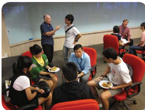
Students meet their USP academic advisors

“The RC is a spatial technology that has been fashioned to integrate living and learning, which will be a cardinal element in fostering a strong intellectual community.”