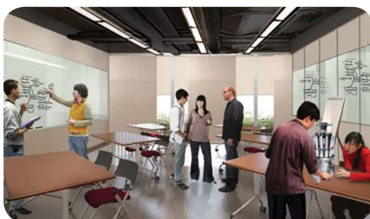
Artist's impression of a theme room in UTown (picture is accurate at the time of printing)

Another element in the student mix will be our Student Exchange Programme (SEP) students. The college will take in a good number of these, and we'll be careful both to choose and to induct them so that they can be fully integrated into college life. The presence of students from different disciplines