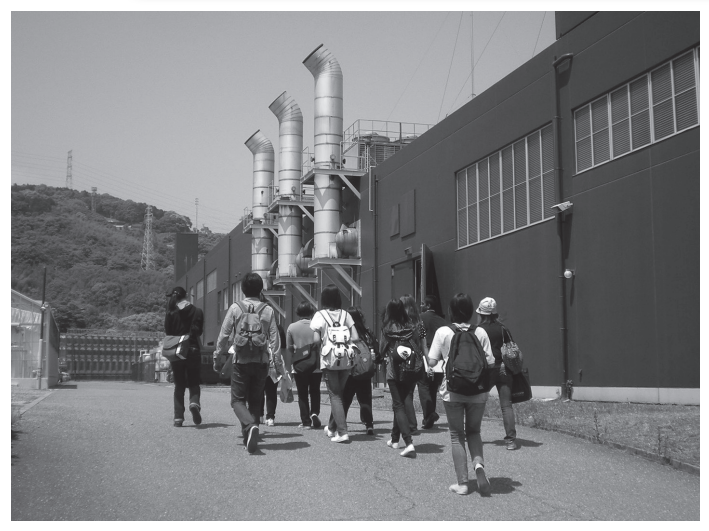
Figure 2. Touring eco-friendly facilities at Huis Ten Bosch.