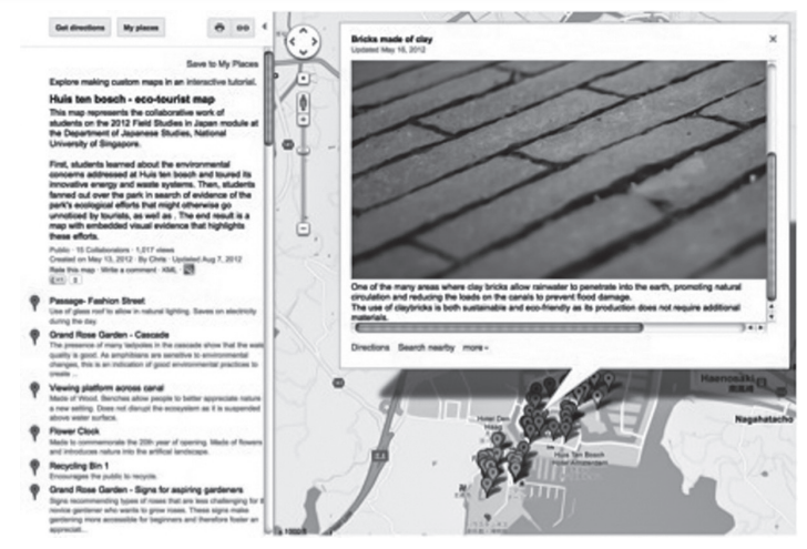
Figure 5. Screenshot of the completed map, focused on a pushpin discussing the ecofriendliness of bricks vs. concrete.