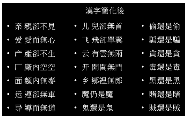
Figure 2. Poem posted on a Facebook page (created based on the image at https://www.facebook.com/火雞哥粉團-600272890103152/ , accessed on June 2, 2016)