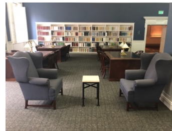
Bridwell’s Classic Chairs

This point also extends to what is in the library and its collections. Not all libraries inspire, nor do all collections enlighten. In fact, there are those bibliographic institutions that may in fact encourage sleepiness, fatigue, and exhaustion—perhaps even disinterest. When I was looking for colleges decades ago, I remember going on a library tour at a university, where the architects and interior designers consulted with behavioral