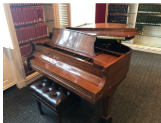
“Ellington,” our foster Steinway

The quest for good space and comfortable seating also relates to what I see as an organic approach to both research and learning, as well as our holistic approach to how we see arts and music in the world. I know that many times when I attend a concert, I am not completely enamored of a certain performance, whether the style or composer. I have a friend who is a brilliant classical musician, but he cares little for the traditional “slow movements” of sonatas, symphonies, and concerti. Every institution or library or museum has its parts like a symphony, and we cannot and will not enjoy every aspect, but it is the holistic experience of being in that space. Many of us can probably relate