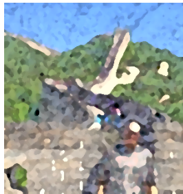
An impressionistic view of the Great Wall of China.

One of the great myths of global history is the functionality and purpose for building the "Great Wall" of China, which in Chinese isn't even called that—rather it is called the "Long Wall" or "City