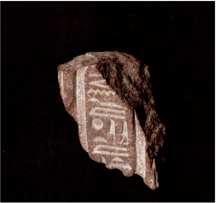
Aten Cartouche Hieroglyphics, Egypt (Amarna), c. 1350 BCE. Red quartzite fragment, approx. 7 cm x 11 cm x 5.5 cm Bridwell Call Number: Lane.I.15 D2/S9/B2