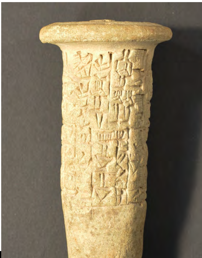
Dedicatory cone, Mesopotamia, 604–562 BCE Limestone, 12.5 cm tall, flat surface 5.1 cm diameter. Bridwell Call Number: Lane.I.14 D.2/S.9/B.3

One of two dedicatory clay cylinders were placed at the entrances of buildings. (From the reign of Nebuchadnezzar II, 604–562 BCE). The cylinder is covered with a text written in three columns of 145 lines, describing the building of the walls of Babylon and temples, the Tower of “Babel” at Ur, and several other biblical sites.