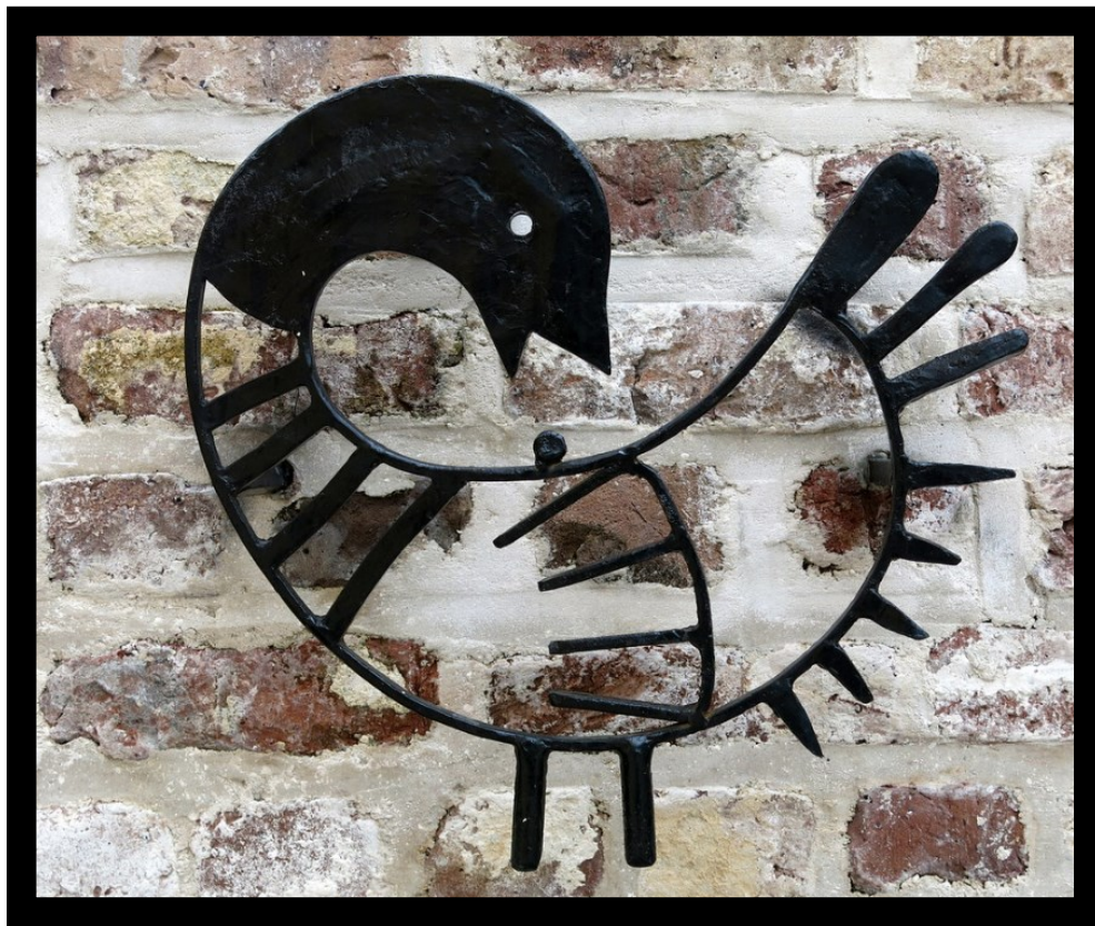
"Iron 'sankofa' symbol on a memorial to the enslaved workers who 'helped' build the Unitarian Church in Charleston, SC"