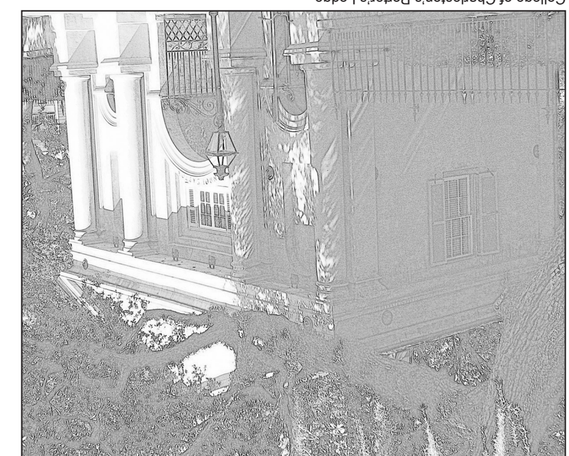
College of Charleston's Porter's Lodge.

Welty's Comedy: The Continuous Process of Revelation.