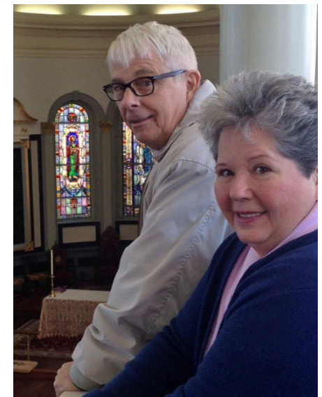
Cathedral Church St. Luke & St. Paul Charleston, SC