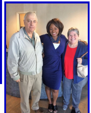
Channel Two Tour