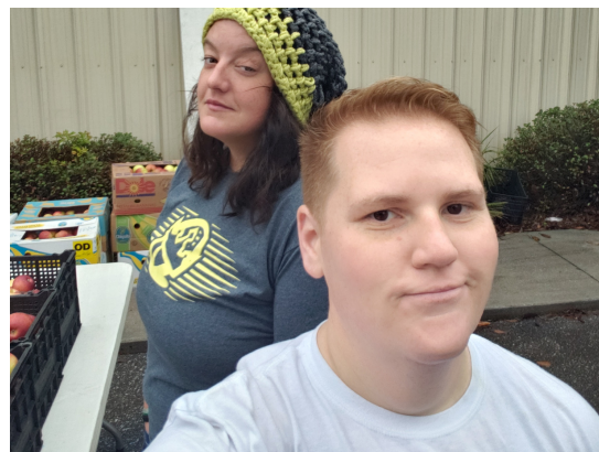
Goettsches & Berk distributing food at a Lowcountry Food Bank event

As activism is a crucial aspect of this course, students are asked to identify "instances of disconnect between the student body and intervention programs designed by the College to address sexual violence through various administrative bodies; they are then tasked with coming up with effective activism approaches to bridge this disconnect and are encouraged to do so by not only critically applying classroom discussions, but also seeking out