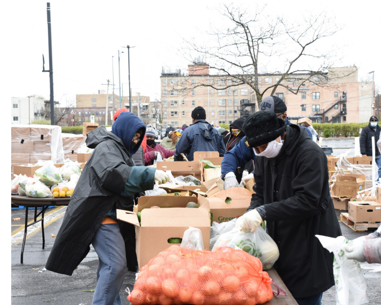
Demand for food at the depository has increased about 50% since the pandemic hit.