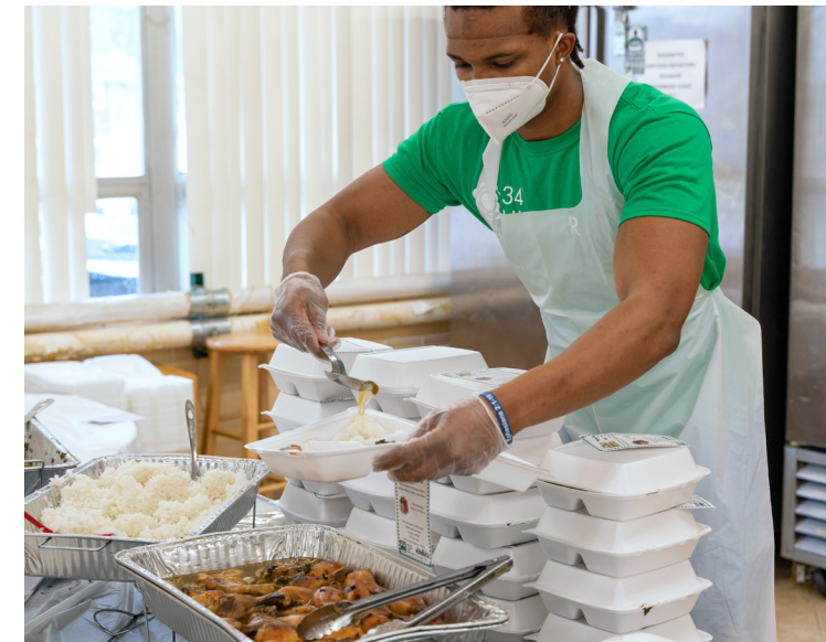
Food bank workers are packaging food under safety protocols.