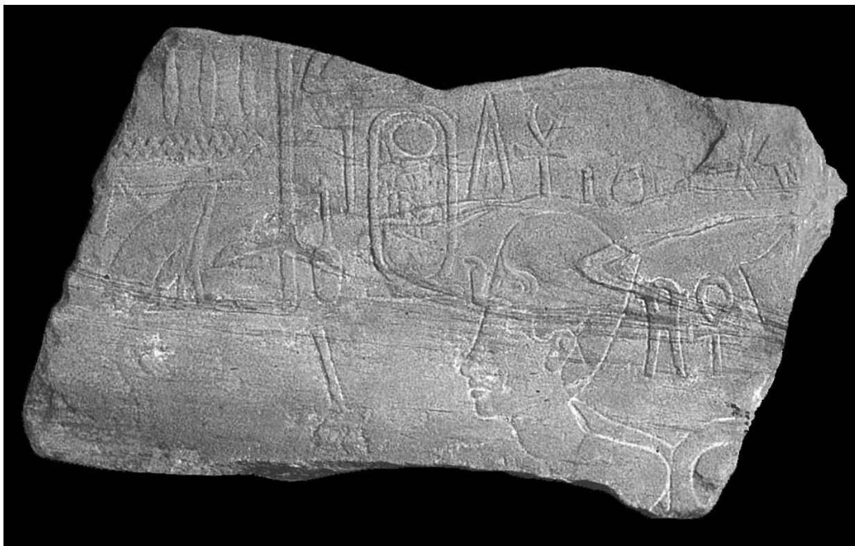
Fig. 1: Liverpool Museum 1967.35.