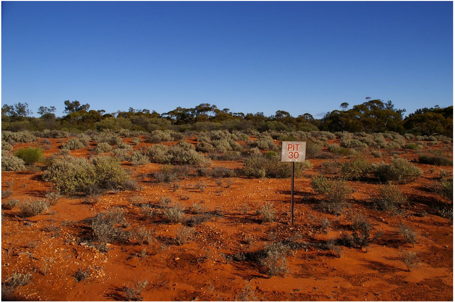
Figure 10: Faded and numbered waste pit signs such as this one can be found throughout the Maralinga test area, denoting a burial site and usually containing radioactive debris, often only meters deep.

hold ‘at least 150 species of hard coral, more than 450 species of fish, more than 630 species of molluscs and 170 known species of sea stars, urchins and other echinoderms.’ 128 Multiple species of scientifically and ecologically important mangroves offer ‘valuable nursery areas for juvenile fish and crustaceans and are stopover areas for rare and protected migratory wading birds,’ according to the WA Department of Environment and Conservation. 129 Dugong, whale, dolphin and turtle species are also recorded within the region. However, radiological contamination from the British nuclear tests still leads to advice for visitors to restrict their visits to the affected islands to one hour only per day and warnings to ‘not disturb the soil in these areas and do not handle or remove