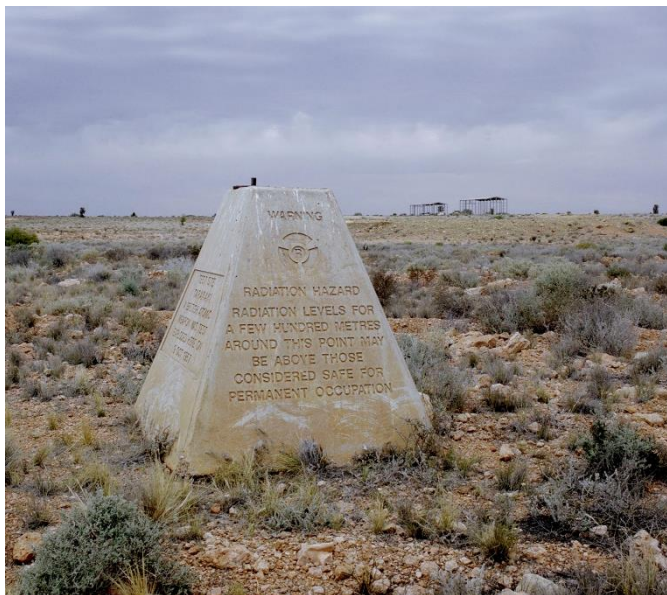
Figure 3: Taranaki Test Site, Maralinga, South Australia.

Weapons Tests Safety Committee (AWTSC) 29 insisted the test ‘posed no hazard to persons nor damaged livestock or other property.’ 30