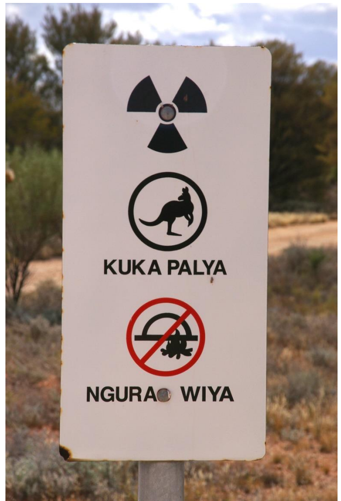
Figure 4: One of the hundreds of warning sings spread across the former nuclear test site at Maralinga.

Between 1966 and 1996, France conducted 179 nuclear weapons tests at Moruroa 40 Atoll (42 atmospheric; 137 underground) and 14 at Fangataufa Atoll (4 atmospheric;