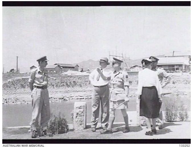
Figure 2: Lieutenant General H. C. H. Robertson, Commander-in-Chief, BCOF, indicating to Dr. Herbert Vere Evatt, Australian Minister for External Affairs, the damage caused by the atomic bomb. Hiroshima, Japan. 1947.

In 1947, an elite special committee led by British Prime Minister Clement Attlee was established in the UK to begin work on a British bomb. Australian Prime Minister Robert Menzies was approached by Attlee in private correspondence in September 1950, to ask, 'whether the Australian Government would be prepared in principle to agree that the first United Kingdom atomic weapon should be tested in Australian territory,' and to give consent for 'detailed reconnaissance' surveys by British. 10 Attlee stressed the top-secret nature of these discussions. While Menzies agreed immediately, he did so without consultation or consent of his Cabinet. 11 British surveys found that the Monte Bello islands off Western Australia