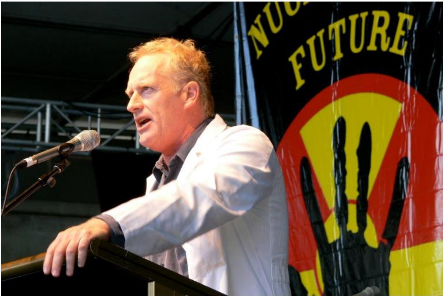
Figure 11: The late Bill Williams, co-founder of the International Campaign to Abolish Nuclear Weapons (ICAN).

While official Defence White Papers published since 1994 by the Australian government have made claim to END, 153 these claims are contested due to a notable ambiguity from the US government. There are no formal, transparent agreements open to public scrutiny in relation to the extension of US nuclear force to Australia. Debates around the origins, scope, reciprocal costs, and the credibility of END policies in Australia continue.