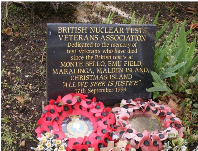
Figure 9: A British Nuclear Tests Veterans Association memorial in the Peace Garden at the Church of St. Thomas, Birmingham, UK.

it was quite another. 122 Significant questions remain about human rights abuses arising from the response of the authorities to this incident, and overall in the treatment of Aboriginal Australians during the British nuclear tests.