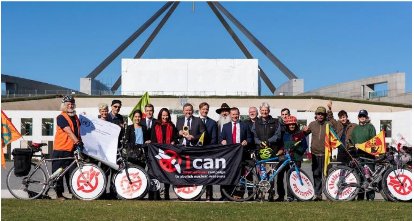
Figure 12: Australian activists from the International Campaign to Abolish Nuclear Weapons (ICAN) present a copy of the 2017 Treaty on the Prohibition of Nuclear Weapons to Australian Parliament in Canberra, following a 900km bike ride across the country.

Clinic of Harvard Law School has demonstrated that accession by US allies to the TPNW need not preclude or hinder existing non-nuclear defense cooperation. 157