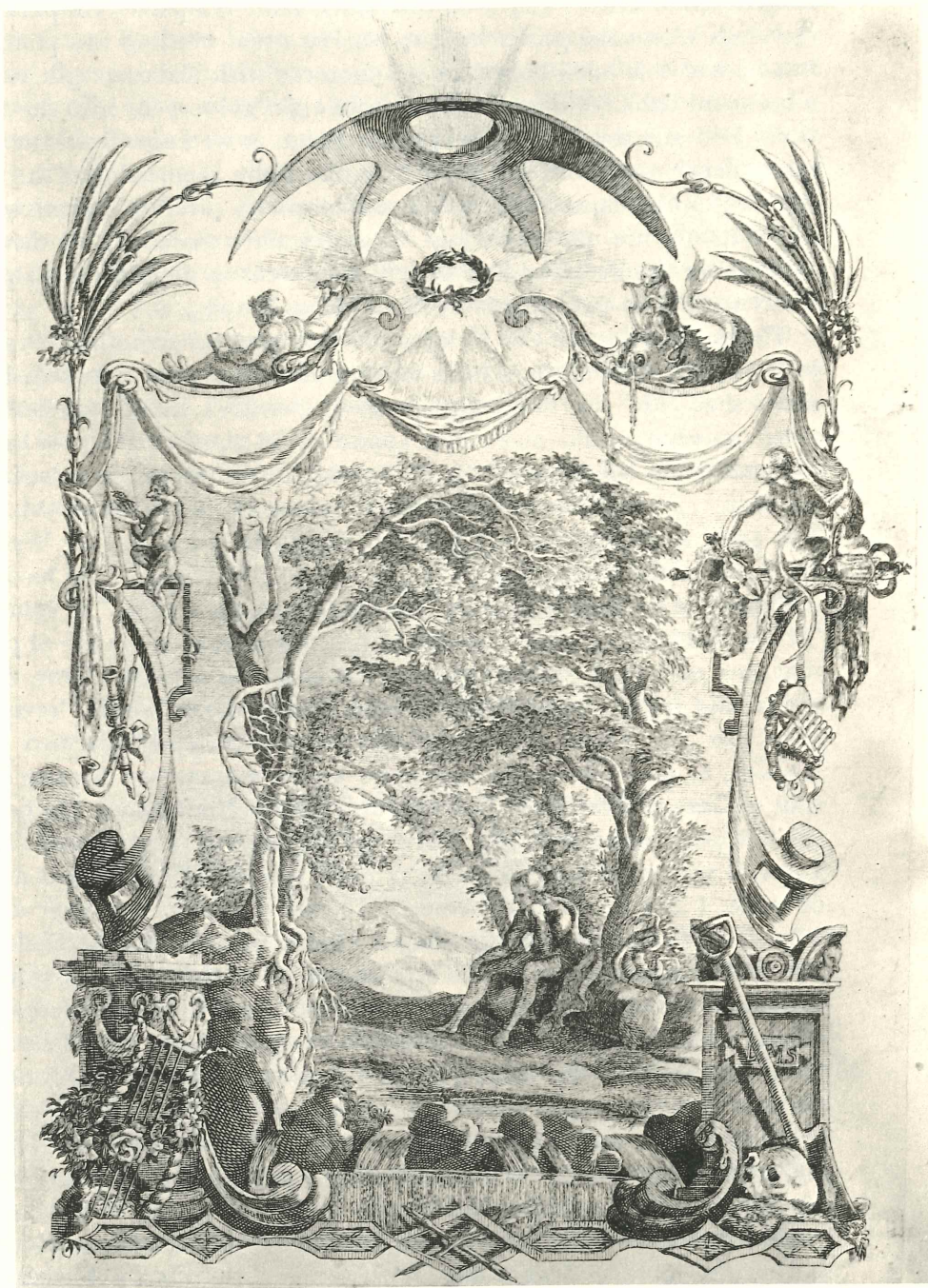
Bentley's Frontispiece to his designs for Gray's Poems, 1753. From the original drawing.