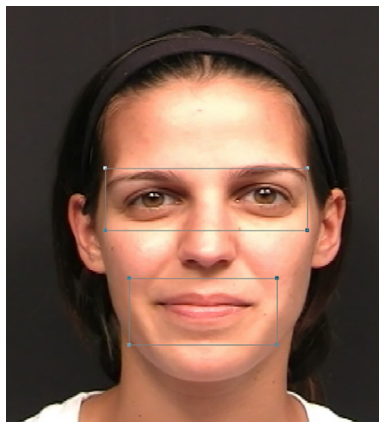
Fig. 1. Still image of one of the faces presented in the study and an outline of the eye and mouth areas of interest.

Although the principal aim of our study was to investigate the deployment of selective attention to the eyes and mouth of a talker producing AV speech, we also took the opportunity to determine whether 18-month-old infants' relative distribution of attention to the eyes and mouth might be associated with the development of expressive vocabulary. To this end, we asked the parents to complete the MacArthur–Bates Communicative Development Inventory (CDI) Toddler form Part IA (“Words Children Use”; 680 words) designed for use with children between 16 and 30 months of age.