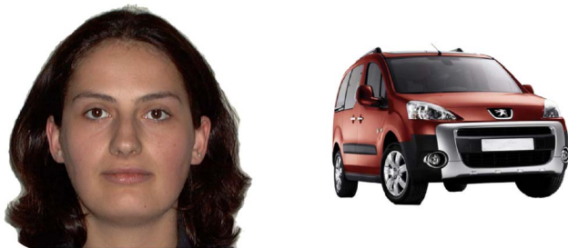
Figure 1. The face and car stimuli used in the visual exploration task (different faces and cars were presented within and between subjects). The subject on the photograph has given written informed consent, as outlined in the PLOS consent form, to publish her picture.

Odor Stimuli. Subjects participated in one of two conditions, one involving a familiar odor and one involving a control odor. The familiar odor was the mother's body odor collected on a t-shirt. A t-shirt (100% cotton) was sent (enclosed in a paper bag itself enclosed in a zip-locked hermetic plastic bag) to the mother in the week preceding the testing of her infant. The t-shirt was worn by the mothers for the 3 consecutive nights preceding their visit to the laboratory. Over this period, they were asked to wear the t-shirt on their skin without using perfume and in refraining as much as possible to shower with odorous soap. During the days, they were instructed to put the t-shirt into the paper bag itself put