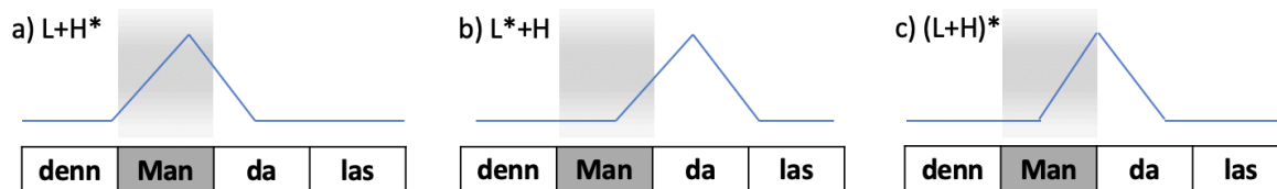
Fig. 1. Schematic representation of rising-falling contours in German: a) medial-peak accent (L+H*), peak aligned in the stressed (grey-shaded) syllable; b) late-peak accent (L*+H), peak aligned in the syllable following the stressed one; c) accent found in German rhetorical questions [7], both L and H aligned in the stressed syllable. Note that a) and b) are GToBI [8] notations, c) is our own label).