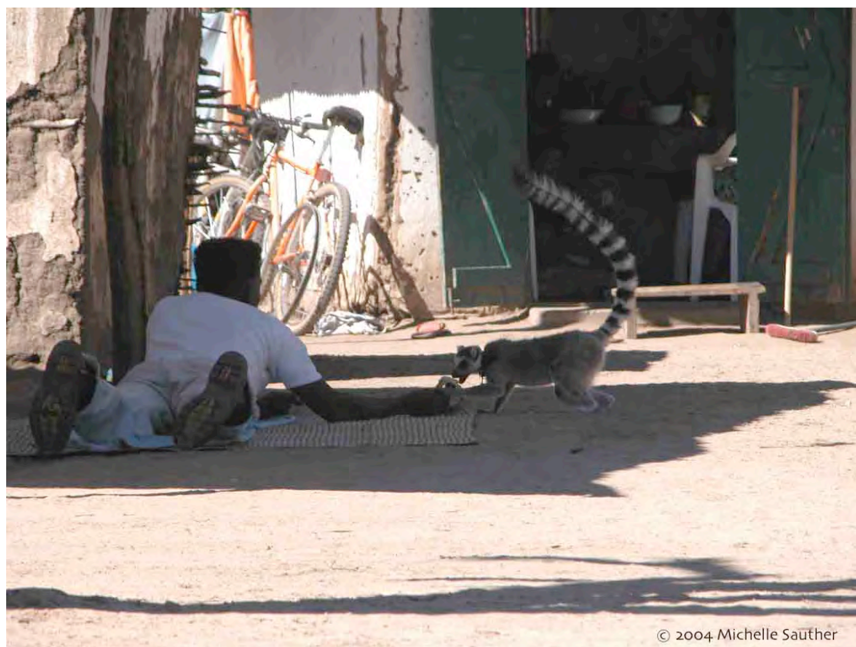
Figure 5. Local villager feeding a banana to a ring-tailed lemur within camp.

collected ectoparasites from anesthetized ring-tailed lemurs by using a tick comb for mites and tweezers to extract ticks.