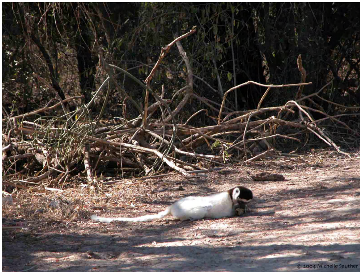
Figure 8. Sifaka chewing on wood within the camp near parcel 1 of the Beza Mahafaly Special Reserve.

Each strepsirrhine species interacted with humans differently. Only one interaction was observed between humans and sifaka. A male sifaka descended to the ground to cross an open area camp to get to the forest on the other side of the camp (figure 7). One of the villager's young children was sitting in the path of the sifaka, who briefly sat down near the child and looked at him. The child immediately began crying and the sifaka continued moving toward the forest. The whole interaction took about 80 seconds. No sifaka were observed using human food or water. One individual did sit in camp chewing on a stick of wood (figure 8). In contrast, two groups of ring-tailed lemurs ranged into the camp and interacted with humans nearly daily. During this study these "camp" groups drank water from buckets at the well (figure 9), raided the research kitchen, ate discarded food at the trash pits or near huts, and consumed human feces at the open-air latrine. The local people in camp were usually quite tolerant of the lemurs, but they would chase them away if the lemurs attempted to steal food. Ring-tailed lemurs also entered local fields and ate the leaves of bageda plants on several occasions during observations. Sifaka were never observed doing this behavior. We noted 39 human-ring-tailed lemur interactions. The average interaction was 69 seconds and ranged from 2-198 seconds.