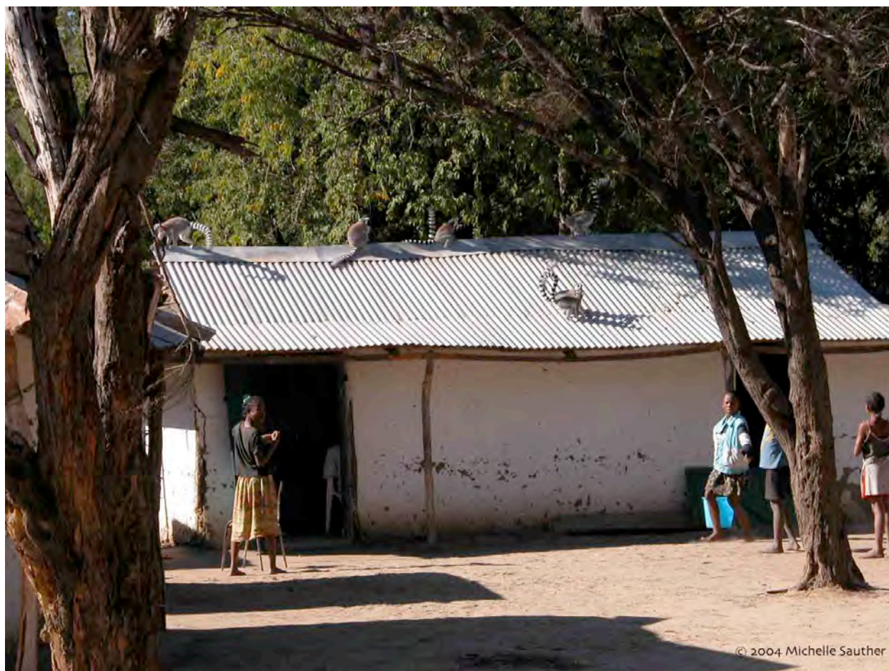
Figure 4. Villagers home in the camp near parcel 1 of the Beza Mahafaly Special Reserve. Note ring-tailed lemurs on the roof.

researchers, an open-air latrine used by the local Mahafaly people (the use of pit latrines is fady ), and several mud block structures for the on-site families (figure 4). During this study two families lived at the site throughout the year 4 . These families cultivated maize and manioc in nearby fields, and raised chickens, ducks, and turkeys all of which ranged primarily within the camp area and surrounding forest. Some social groups of ring-tailed lemurs and sifaka utilize both the reserve and camp. Most sifaka and ring-tailed lemurs in this population bear color-coded collars that identify their group, and a tag number that identifies each individual (Figure 2). The ring-tailed lemurs and sifaka at BMSR has been the subject of a number of long-term studies by Drs. Robert Sussman, Alison Richard, Diane Brockman, Michelle Sauter and Lisa Gould.