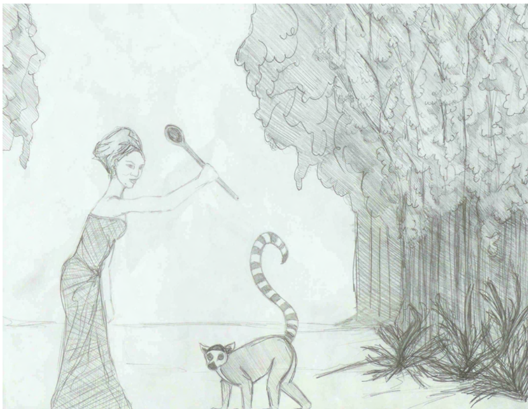
Figure 12. Mahafaly origin myth: these beatings ultimately transformed the first wife into the maky (ring-tailed lemur).