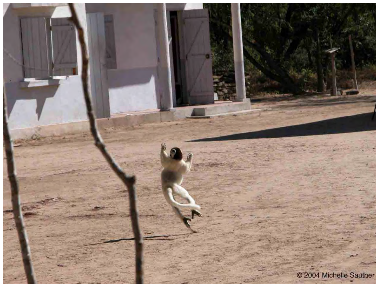
Figure 7. Sifaka moving across open area in the camp near parcel 1 of the Beza Mahafaly Special Reserve.