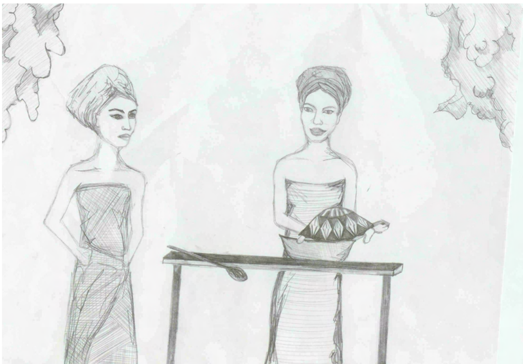
Figure 10. Mahafaly origin myth: A man captured a radiated tortoise ( Geochelone radiata ) for dinner. He gave the tortoise to his first wife and left for the day.