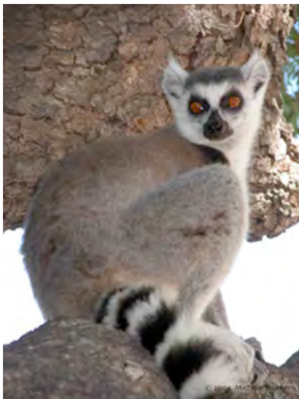
Figure 1. Ring-tailed lemur, Lemur catta within parcel 1 of the Beza Mahafaly Special Reserve.

goals: to examine how each species' socioecology affects parasite type and prevalence, including seasonal fluctuations of parasites among each primate species; to examine the behaviors that ring-tailed lemurs and Verreaux's sifaka utilize to potentially eliminate, avoid, or reduce parasite infections; to determine how social rank and sex affects individual parasite prevalence for both species; and to understand how an anthropogenically-altered habitat affects all of these patterns as compared to those documented for groups living in undisturbed habitats. This project integrates primatological, cultural anthropological, and parasitological methodologies to understand how the attitudes of Mahafaly toward the reserve as well as the interactions between nonhuman primates and the Mahafaly impact the success of BMSR.