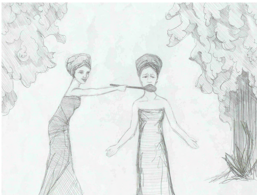
Figure 11. Mahafaly origin myth: His second wife became envious and subsequently, she beat the first wife repeatedly with a wooden spoon.