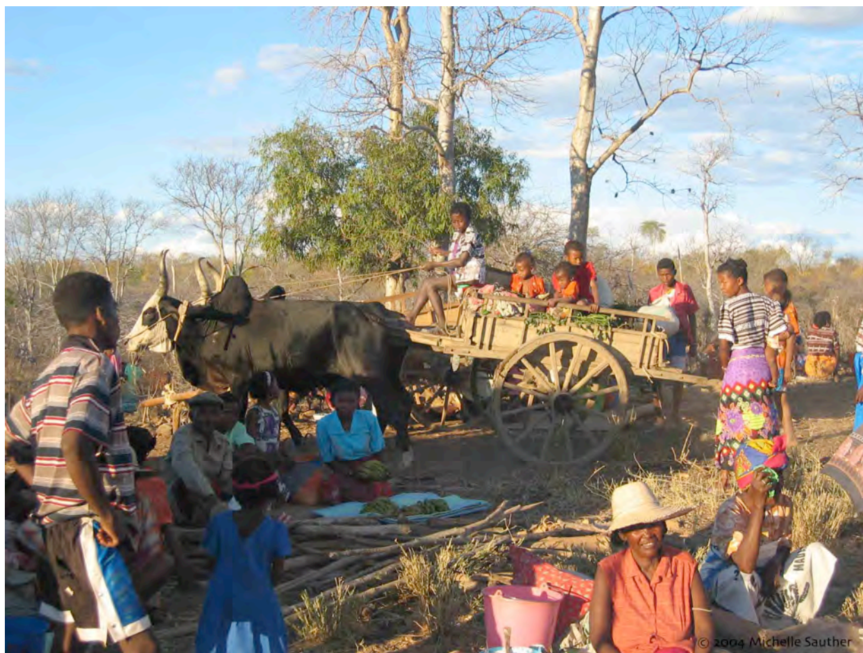
Figure 3. Local Mahafaly people near Beza Mahafaly Special Reserve.

The local people are composed of Mahafaly, Antandroy and Tanala peoples (figure 3), (Ratsirarson 2003). Families live in straw and wood huts, with most family members coming from the surrounding areas. This is a patriarchal, agrarian society that focuses on maize, cassava and sweet potatoes ( bageda ), as well as zebu cattle, goats, sheep and chickens. Two types of herding methods are used. Midada allows livestock to roam freely in the forest with the owner gathering periodically. The other, miarakandrovy involve active herding of the animals with livestock kept near the village each evening (Ratsirarson 2003). Land is viewed as privately owned and inherited from ancestors. Tortoises and lemurs are fady (taboo) to hunt (Rambeloson 1988).