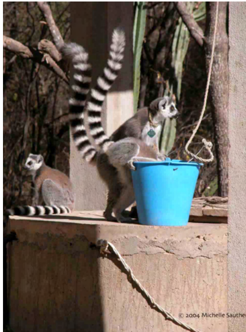
Figure 9. Ring-tailed lemurs in the camp near parcel 1 of the Beza Mahafaly Special Reserve drinking water near the camp's well.