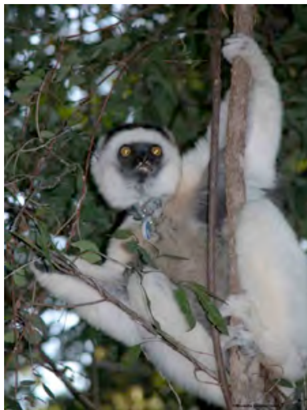
Figure 2. Verreaux's sifaka, Propithecus verreauxi verreauxi within parcel 1 of the Beza Mahafaly Special Reserve.