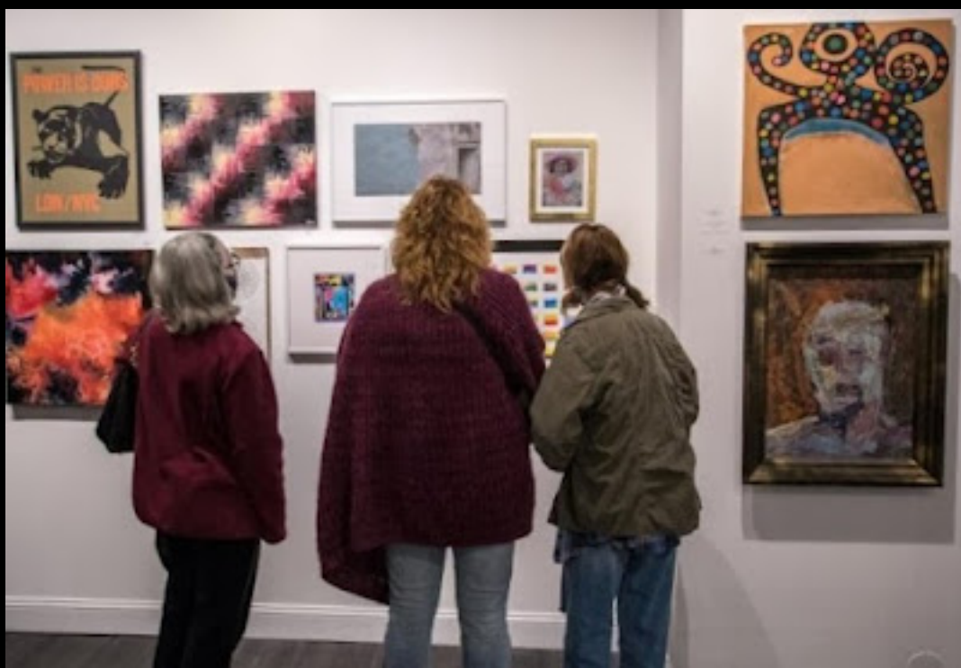
The Annual Members' Show at Albany Center Gallery is always a crowd-pleaser