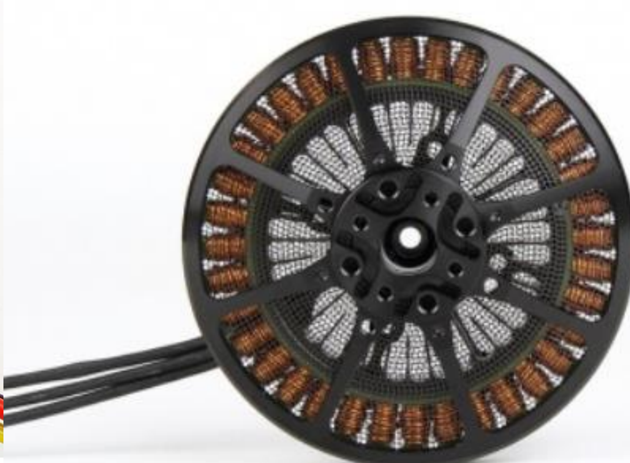
Figure 2: Cobra 4130/20 KV 300 Figure 3: T-Motor U8 Lite, KV 190