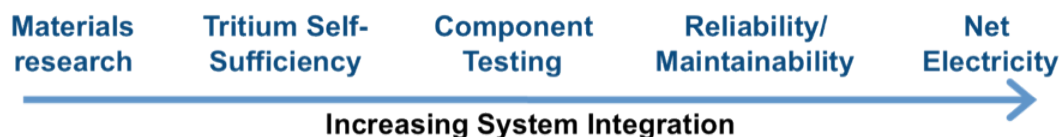
Figure 2. Graphic illustrating the range of missions for next-step fusion nuclear facilities (FNF).

In China, South Korea, the U.S., and India, plans are being developed for major fusion nuclear facilities (FNF) as intermediate steps between ITER and DEMO. Such facilities, together with their accompanying programmes, are intended to advance the research and development in fusion nuclear technology with a steady-state or high duty-factor deuterium-tritium plasma, using the released energetic neutrons to test materials and components, close the fuel cycle, and generate electricity. However, there is no single vision for an FNF; the span of possible missions ranges from basic science research that requires an FNF environment to demonstrations of fusion's practicality up to and including the generation of net electricity and high-temperature heat (Figure 2).