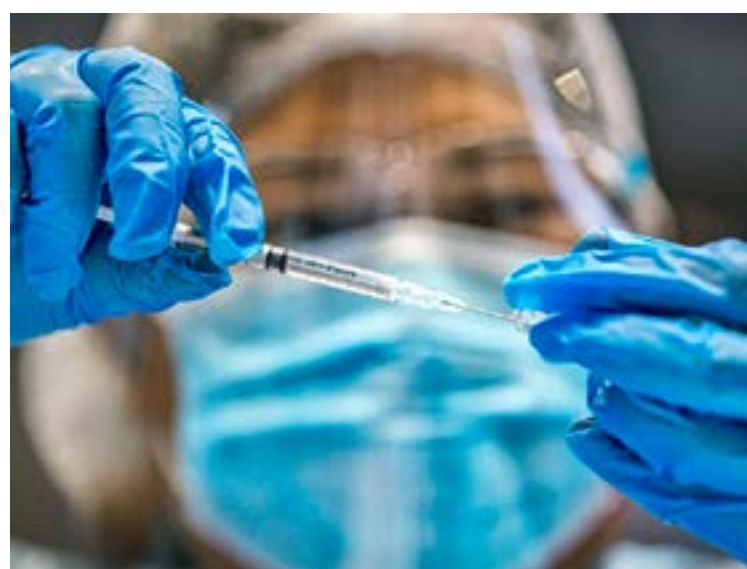
Broward College aims to prevent the spread of COVID-19 virus and additional strains through the Vaccine and Booster Shot Incentive program.

Vaccine incentives began in mid-August of 2021, while the vaccine booster incentive