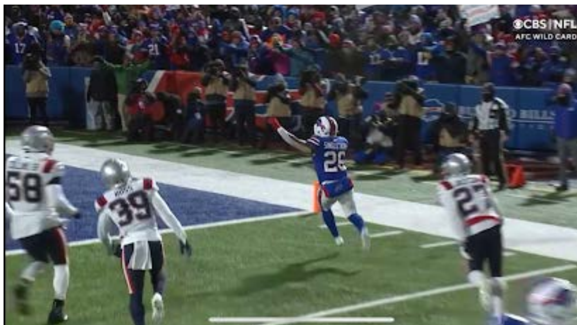
Josh Allen and the Bills vs Mac Jones and the Patriots

Following the Wildcard games will be the Super Bowl LVI. The game is set to air on the second Sunday in February.