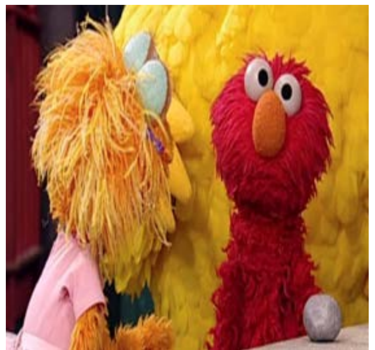
Elmo and Zoe in Sesame Street

Elmo's contrast in personality in this scene ended up being hysterical to many, with the original poster of the clip, @wumbooty, captioning it with "there are tears in my eyes y'all my stomach hurting." The initial tweet garnered around 450,000 likes and 25,000 retweets as of January 18th and has caused a wave of more clips being posted that highlight the one-sided feud between the two. The feud gained so much attention that Elmo himself ended up responding to the sudden