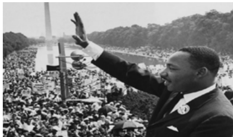
Martin Luther King, Jr. gives his famous "I Have A Dream" speech during the march on Washington.

It is an unfortunate setback that, for the time being, no formal grants for the MLK Day of Service at Broward College will be awarded this year due to budget cuts at Broward College. For 2020, Broward College awarded 29 community groups with the Broward College MLK Day of