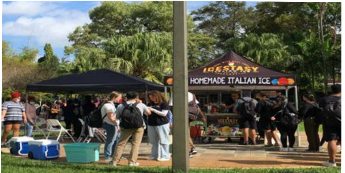
Broward College hosts a Wipeout Event to encourage students to engage with one another in a fun, interactive environment.