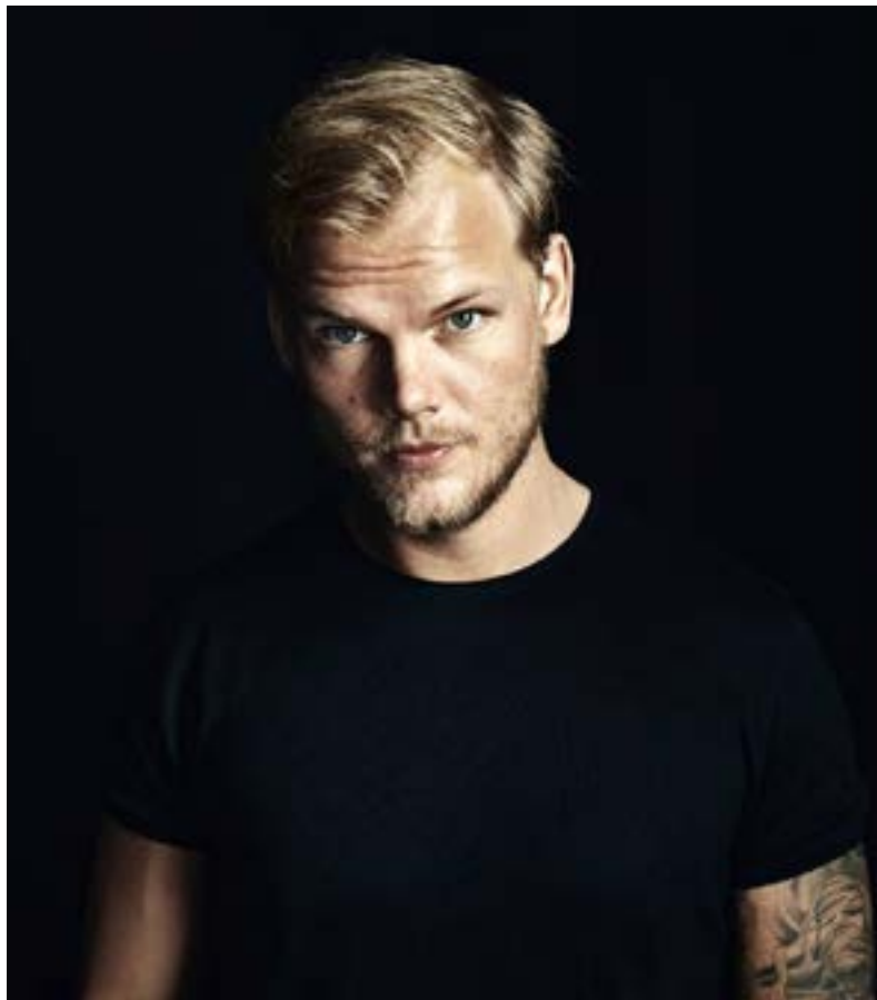
Avicii Experience will open in Stockholm, Sweden in 2022.

In an interview in 2013, Avicii went on to say, "I discovered when I started making money that I didn't really need it." Instead, he turned towards charitable donations, embarking on a tour called "House for Hunger" with which he donated all incoming proceeds to