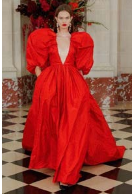
Left: Dress from Carolina Herrera and right: from AMI.