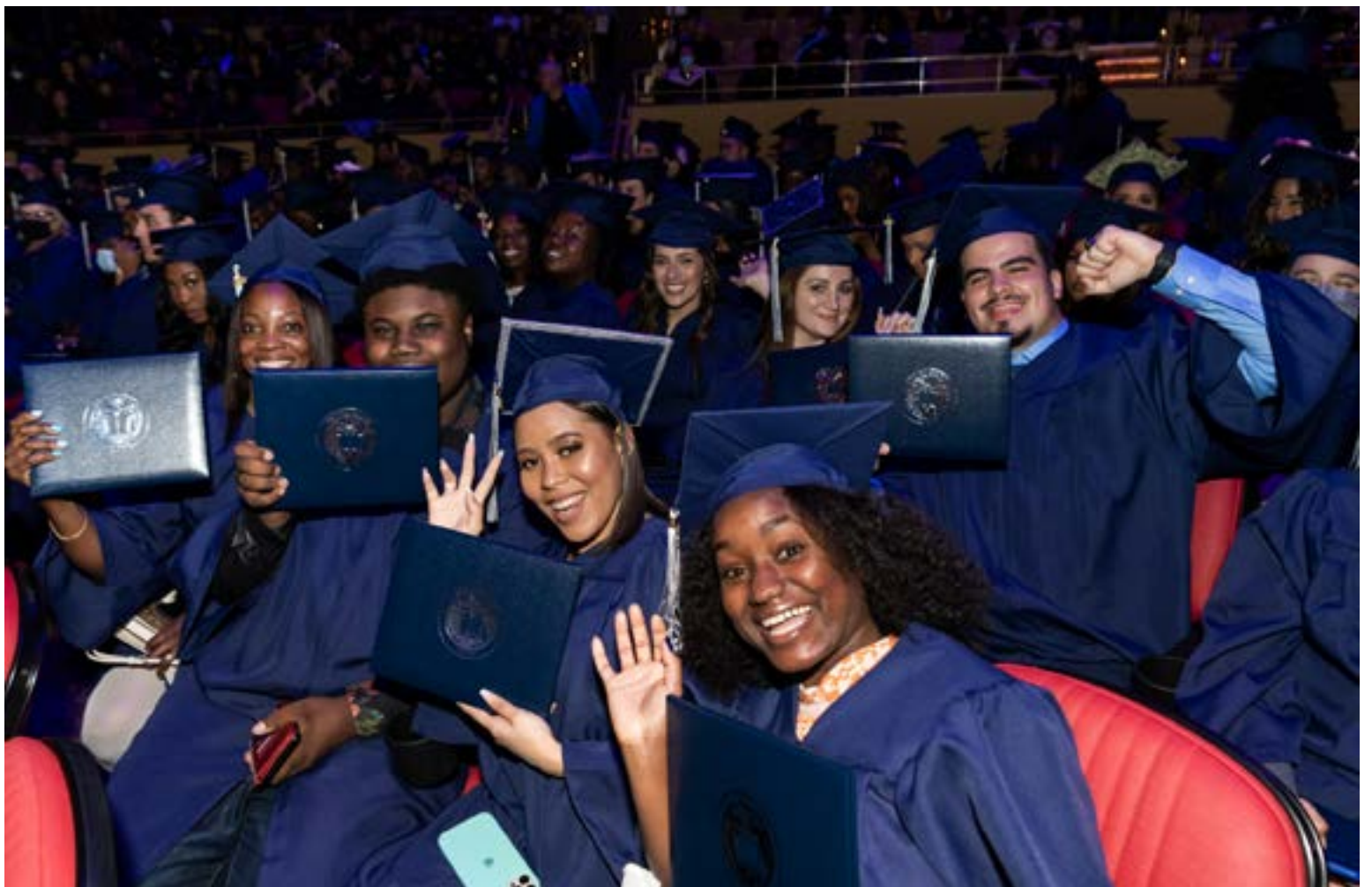
Some BC students during the recent graduation on Dec. 15 at the Hard Rock Live.

She was inspired by the surviving child of a set of twins she gave birth to over a decade ago. While one child survived,