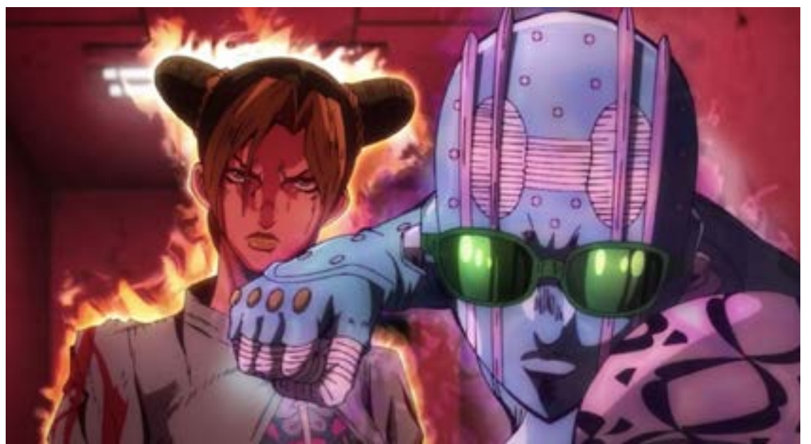
Jolyne Her Stand, Stone Free

JoJo's Bizarre Adventure is known for its complex and cerebral fight scenes between Stand users or those with other special abilities, and Part 6 took this to an extreme; it may even have gone a bit too far. The Stone Ocean manga was weakened because the medium of a comic was less than ideal for portraying the increased complexity of the fights, making some of them convoluted and tedious to read. For this