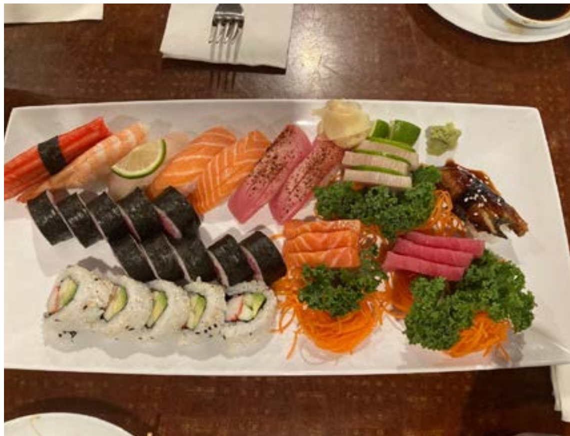
Some sushi from Rice Up.

One notable menu item is the General Tso's Chicken. With its crispy breading, tender white meat and distinctly sweet sauce, this dish has be-