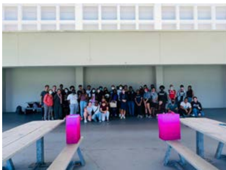
College Academy students.

Transitioning from a larger high school to College Acad-