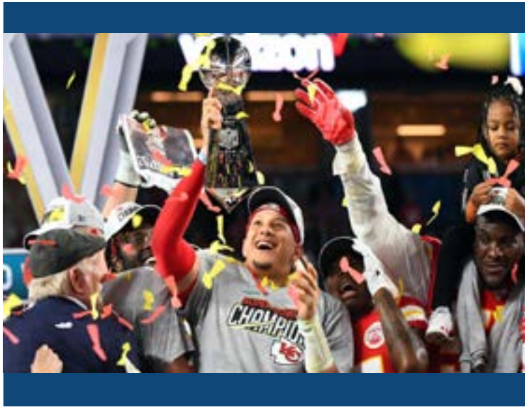
Mahomes and the Chiefs winning the Super Bowl

The Super Bowl took place on Sunday, February 12, at 6:30 pm. One of the most epic Super Bowl matchups, the Chiefs vs Eagles, took place in Glendale, Arizona, at the State Farm Stadium. Super Bowl 57 encapsulated the 3rd most viewership of all time, with 113 million plus viewing on FOX, as well as a Super Bowl record, 7 million plus streams (18 percent increase from last year's Super Bowl). This was one of the highest scoring Super Bowls (38-35), in recent history, since Super Bowl MVP, Nick Foles and the Eagles, defeated Tom Brady and the Patriots. The Super Bowl would've been even more high scoring if the field wasn't considered a slip and slide by the majority of the players because most of them have to change their cleats to adjust to the terrible field. The most important matchup in the Super Bowl was Patrick Mahomes vs Jalen Hurts, and their performances didn't disappoint whatsoever. Hurts started the festivities in the 1st quarter, with a one-yard touchdown run, which he has been executing all season. The Chiefs answered the Eagles, with Mahomes passing an 18 yard touchdown pass to Travis Kelce, their connection again has come up clutch, in the most