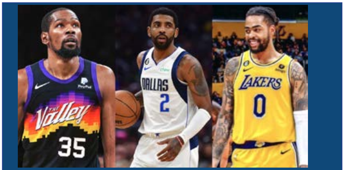
League-altering trades (ESPN.com)

The Raptors finally made a decision to retool, by acquiring Jakob Poeltl for Khem Birch, a 2024 protected 1st round pick, and two future 2nd round picks. Early in trade deadline, the Lakers acquired Rui Hachimura for Kendrick Nunn,