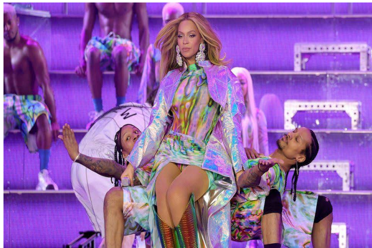
Beyoncé Renaissance World Tour Opening Night - Stockholm.

One of the highlights of the show is when her daughter Blue Ivy joined her on the stage performing her song, My Power . Beyonce put emphasis on the lyrics, "This is my bloodline on the frontline," as she and Blue Ivy gave pure energy to the crowd. I witnessed a concert that was electrifying and had lots of people in the stadium sashaying down the aisles, dancing, and performing some of her routines as the beautiful Beyonce performed on the stage. It was lights, cameras, and action throughout Hardrock Stadium. Everyone had their cell phones recording an unforgettable event. Outside of Michael Jackson, I think that Beyonce puts a lot of effort into her stage presence, dance routines, and