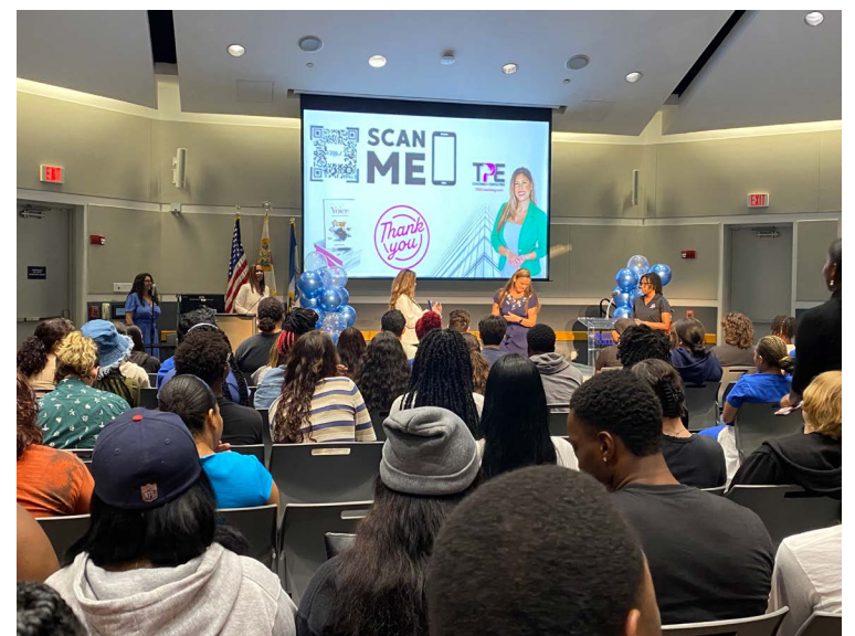
The Convocation on North Campus.