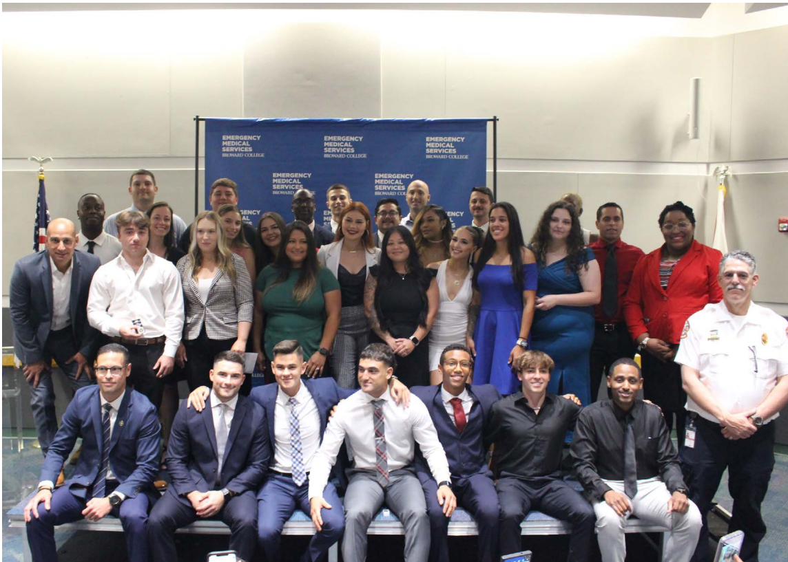
Term 2022-2023-3 Paramedic Graduates.