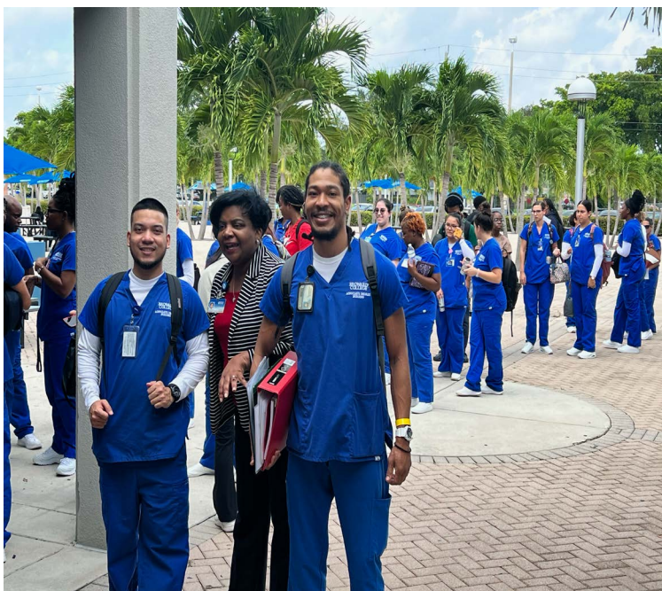
Students getting ready for the Convocation on North Campus.