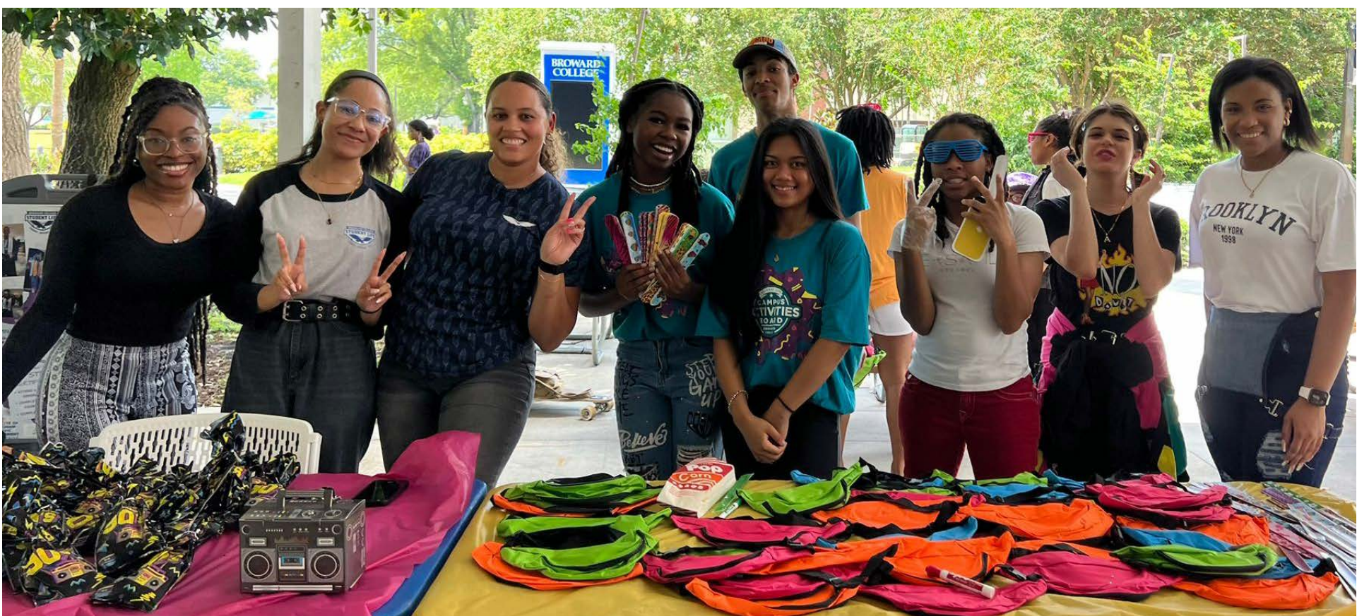
Students during the music, food and bingo 90s and 2000s event held recently on Central Campus through Student Life.