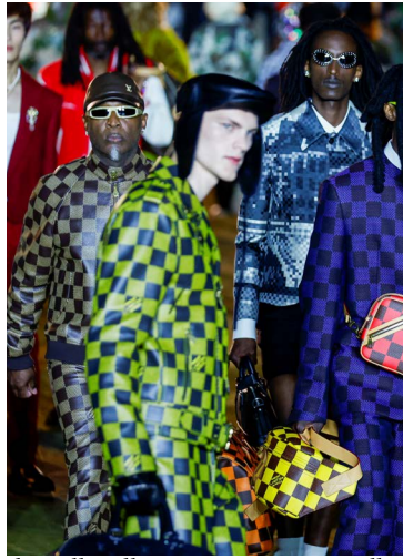
Pharrell Williams Louis Vuitton collection

The collection is a beautiful blend of different styles, including music, street fashion