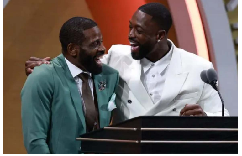
Dwyane Wade and his dad. also in his NBA career.

Wade's Hall of Fame induction ceremony took place a week after Thomas's induction ceremony, in Springfield, Massachusetts, on August 12, 2023. He was inducted into the Hall of Fame by his idol, Hall of Famer, and all-time great NBA player, Allen Iverson (A.I.). His 2023 Hall of Fame class was extremely stacked, with other NBA greats including Greg Popovich, Dirk Nowitzki, Pau Gasol, Tony Park, Becky Hammon, and etc. Wade was the fifth overall draft pick out of Marquette University, by the Miami Heat, behind 1st overall pick, LeBron James, in the 2003 NBA draft. He used everything he endured in his childhood and teenage years, also not being highly recruited by colleges, as motivation to be great, which meant he essentially had "a chip on his shoulder" his whole life,