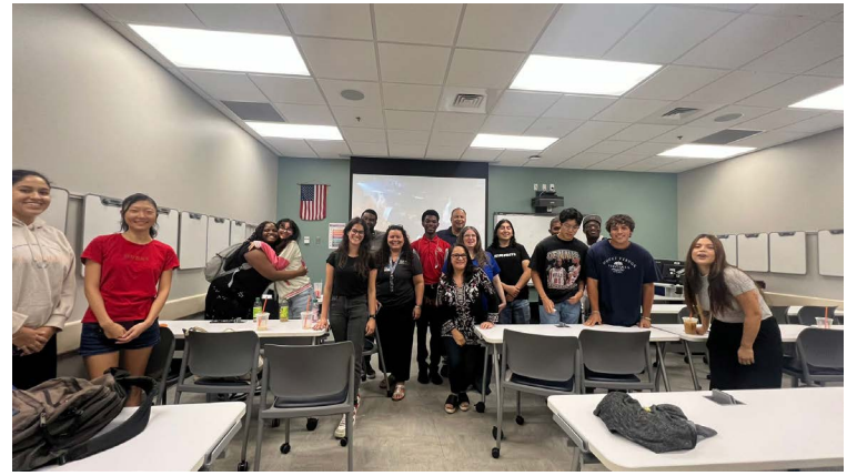
Broward Collage International Students.

Whilesome may underestimate the value of a community college education, the numbers don't lie. A significant percentage of students graduate from community colleges and move on to achieve great success in their chosen fields. The support