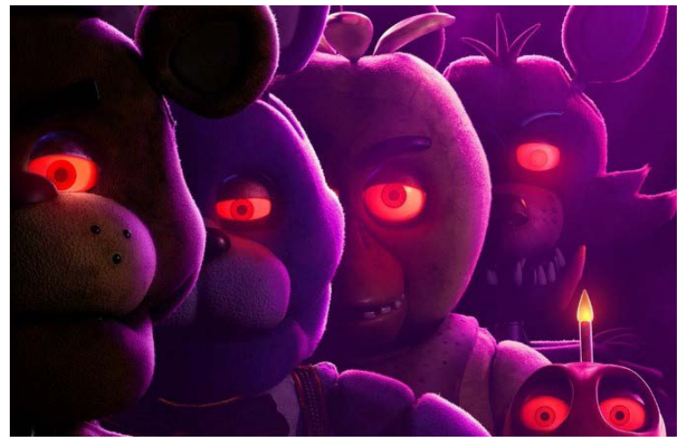
The Official FNaF Teaser Poster

Third, there is plenty of community support and excitement surrounding the project. Scott Cawthon, the creator of the original show is intimately involved in the whole directing operations, ensuring that it remains faithful enough to placate dedicated fans; meanwhile, there is scheduled to be several cameos from some of the frontrunners in FNaF Youtube channels that helped mold the early fledgling series.