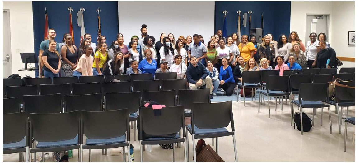
Sabor Latino