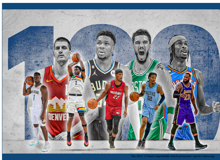
Playoff Caliber teams