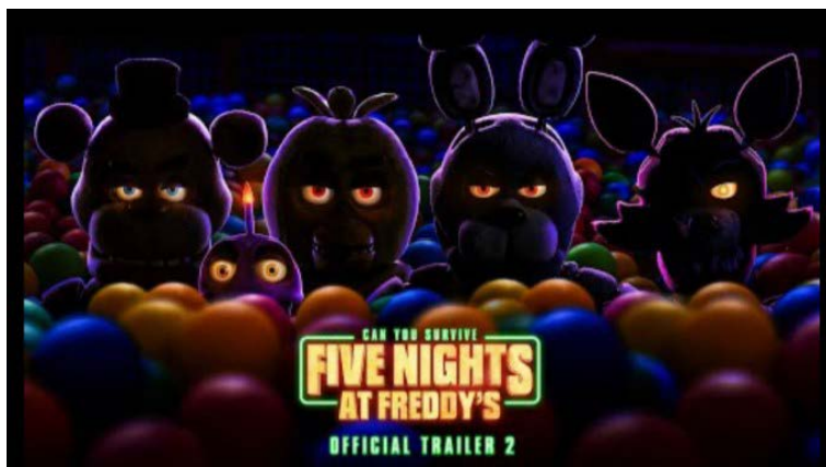
FNaF Trailer 2 Thumbnail