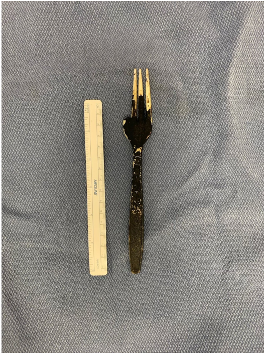
Figure 3. Plastic fork measuring approximately 18.5 cm by 3 cm.