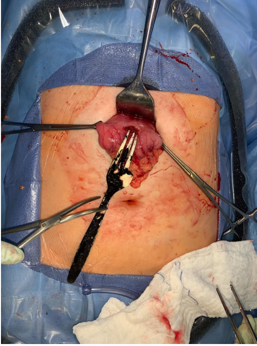
Figure 2. Intraoperative visualization of the foreign object with one prong noted to be missing.

unremarkable and did not demonstrate the fork as seen on EGD.