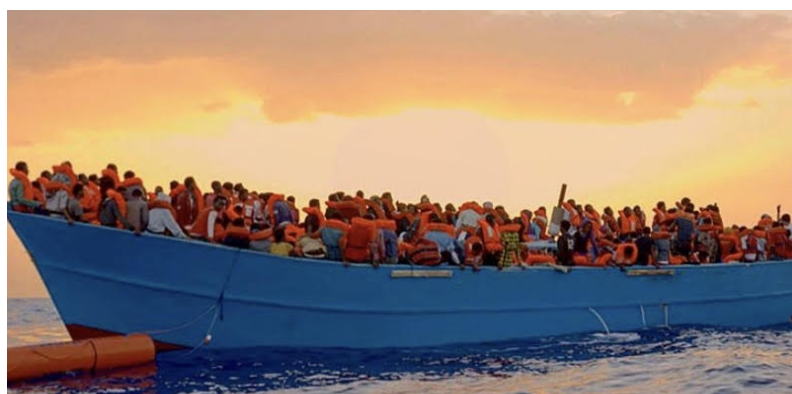
Image from the documentary film, Lifeboat , directed by Skye Fitzgerald. For more info: https://www.lifeboatdocumentary.com/

Amnesty International's (AI-CMC) first event of the semester was an "I care about ____" wall. The wall was an opportunity for students to write down a human rights issue(s) they are most passionate about. Also, AI-CMC hosted a screening of Lifeboat , a documentary about the Syrian Refugee Crisis, for Human Rights Day, December 10th, 2019.