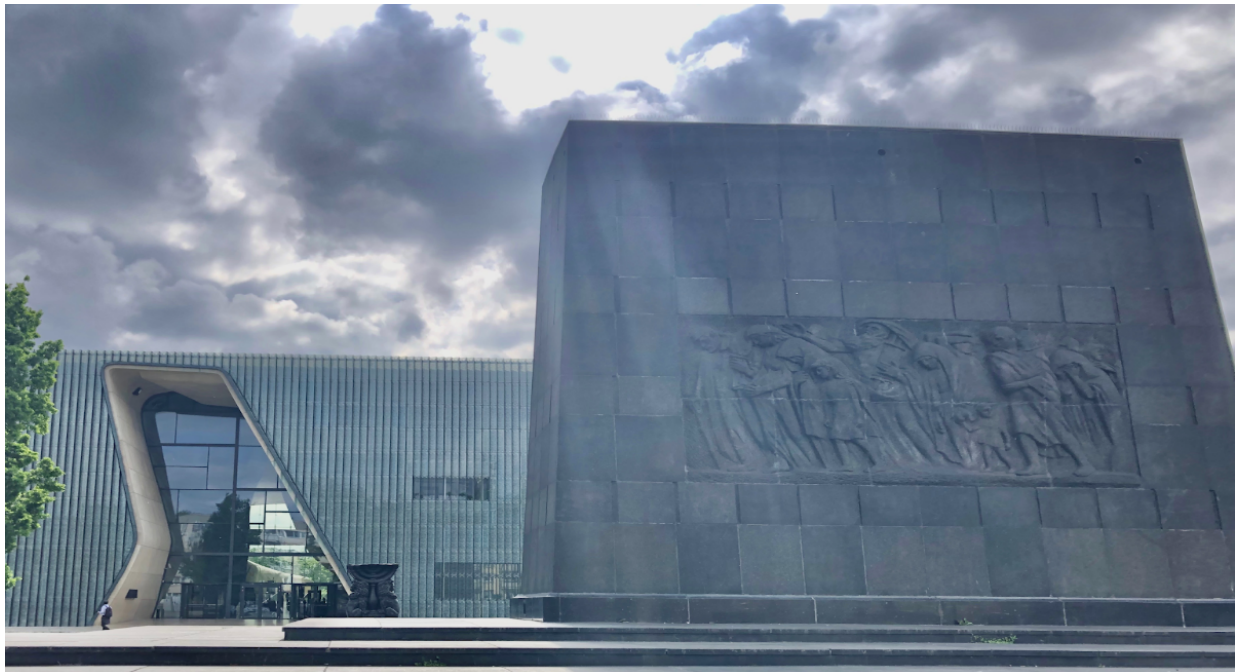
Above: POLIN Museum of the History of Polish Jews, which was built on land that was once within the Jewish Quarter and the territory of the Warsaw Ghetto. In front is the Monument to the Ghetto Heroes built in 1948 by Natan Rapoport to commemorate the 1943 Jewish Ghetto Uprising.

2019 Mgrublian Center summer intern, POLIN museum, Warsaw, Poland