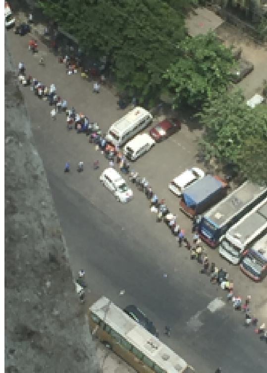
A line of Migrant workers waiting (taken from my window)

In the first months of the coronavirus pandemic, it was termed the great equalizer, because the virus infected people regardless of race, ethnicity, or socioeconomic status. Since then, it has become clear that there is nothing 'equalizing' about this crisis, and the lockdown, Although keeping us safer from coronavirus, the situation has stripped people of their livelihoods and put their health and wellbeing more at risk than ever.