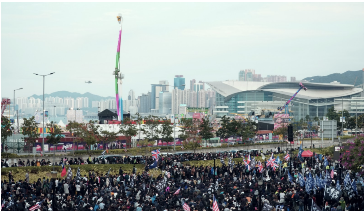
A Chinese military helicopter flies low as protestors hold a peaceful rally calling on the international community to sanction the Hong Kong government.

After seeing police demonstrate that the confiscated "offensive weapons" could burn newspaper, one man raised a copy of People's Daily, the official Chinese Communist newspaper, for others to "burn." As the Star Wars theme played, protest supporters gathered to shine lasers and gasp in mock astonishment at the fully-intact paper. Soon, glow-sticks, disco balls and speakers were brought out as people danced, played party games and projected hand-shadow shows onto the planetarium.