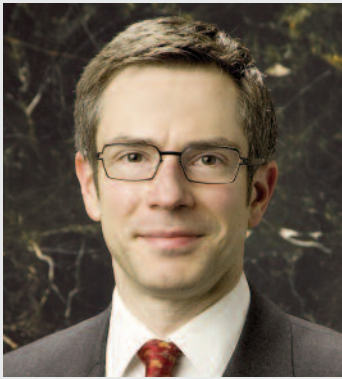
Randall S. Kroszner

AS PART OF THE Financial Economics Institute Speaker Series, Professor Randall S. Kroszner spoke at the Athenaeum on February 12, 2015 about the financial crisis that began in 2008 and its aftermath. Kroszner is the Norman R. Bobins Professor of Economics at the University of Chicago's Booth School of Business. He was an