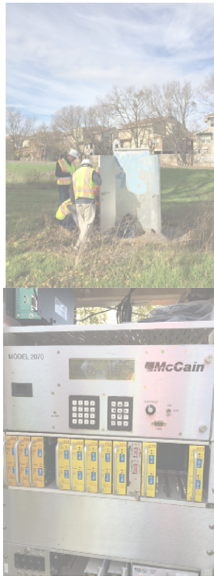
Figure 1: Students and a Caltrans engineer downloading data from controller box (left), and detector rack inside the controller box.

Waze. Since we have high granularity data from the Bluetooth system, the sampling rate from this system was obtained and it ranged from 5-10% in most cases. A simulation study to find the critical sampling rate under which the sample average travel time is a good (95% confidence) representation of the population's average travel time, and the value was found to be at 5%. Consequently, the Bluetooth travel times were used as the ground truth, against which travel times provided by vendors were compared.