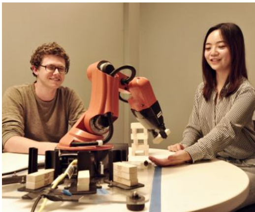
Fig 3. Tower construction task that allows the exploration of the impact of a robot's resource allocation behavior on group interaction and performance.

sembly or building tasks that are used in many other human-robot collaboration studies but extends those tasks to groups of people. In a pilot study with N=62 teams of two human participants each (124 participants overall), we found that how a robot distributes resources among team members impacts interpersonal interaction. Our work on this task has attracted increasing attention and also formed the basis for a collaboration with Noshir Contractor at Northwestern which is being funded by the Army Research Lab.