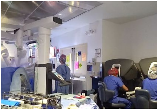
Fig 2. Surgical team performing a surgery with the DaVinci surgical robot.

UNDERSTANDING HOW ROBOTS TRANSFORM TEAMWORK IN AN ORGANIZATIONAL SETTING. During my postdoc I learned about robotic surgery with the DaVinci surgical system (Fig. 2). I learned that the DaVinci surgical system is designed based on a conceptualization of surgery as a practice of cutting and joining tissue performed by only one person, the surgeon. However, surgery is performed by a closely knit team that is dependent on effective communication and interaction. The surgical robot displaces the surgeon from the rest of the team to operate a console typically placed in an isolated corner of the operating room. I got immediately interested in the question about how the use of such a robot influences those interpersonal and emotional dynamics in teams that I have come to understand as uniquely important for a team's overall effectiveness. Over the past 6 years I have secured initial funding from