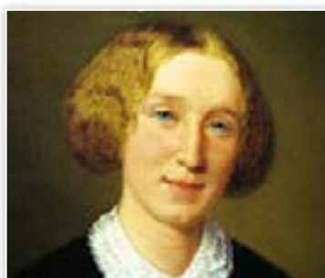
Mary Anne Evans (George Eliot)