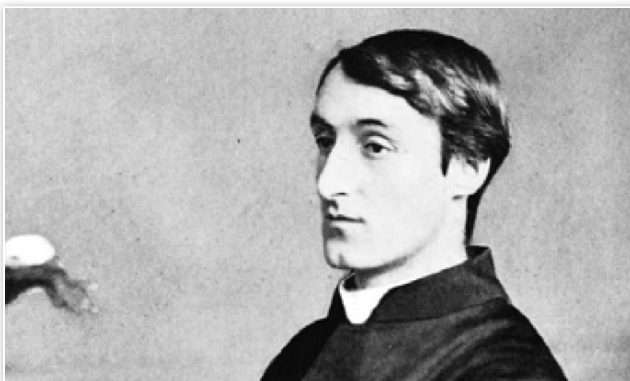
Gerard Manley Hopkins

Please note: Some scholarships and academic tracks require that you maintain a certain grade point average. My grading policies are fair, and I'm always willing to discuss concerns you have over any specific grades when I return them to you. But I will not negotiate an overall course grade based on your jeopardized scholarship (or any other social or funding pressures). I am committed to fair, ethical, and equitable grading at all times.