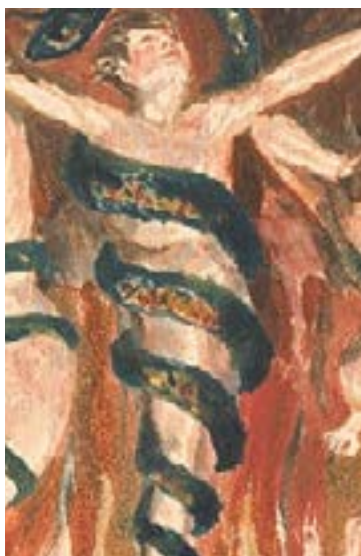
Romantic Poet William Blake's artwork

Emory's policy on respect and consideration in the Code of Conduct