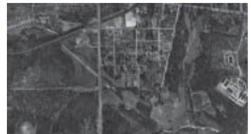
Boulevard Crossing, 1949

Boulevard Crossing's commercial and industrial growth continues in the decade between 1940 and 1950. Three large industrial structures are shown on the Sanborn Maps in 1940 just south of the beltline and east of Boulevard. These structures are made of concrete, steel and iron and function as a tire warehouse, furniture warehouse, and a DuPont Company storage facility. All of these structures properties directly abut the beltline giving them quick access to rail transport. Along the west side of Boulevard and on the south side of the beltline the R.C. Clark Planing Mill is listed as existing just behind six small dwellings that face Boulevard. In addition to the planing mill a propane gas tank is shown adjacent to the south side of the beltline tracks. It is also on the 1940 Sanborn Maps that the Georgia Power substation first appears at the corner of Cherokee Avenue and Mead. The map indicates a brick generator room, oil tanks, and large areas of transformers.