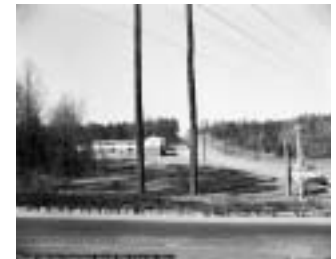
Boulevard and Englewood, 1954

Multiple dwellings are also found along Mead west to Grant Street. Areas north of Englewood, south of the beltline and west of Boulevard continue to be large expanses of unoccupied land. In the 1950s in response to the need for public housing the city of Atlanta built the