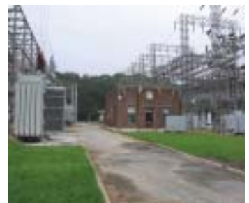
Georgia Power Substation

Located adjacent to the single-family homes on Grant Street is the Georgia Power Substation. Included inside the substation is a 1930s brick building with art deco elements. The building has a flat roof with three bays on each faÁade with stone lentils and window sills. Each faÁade is detailed with brick pilasters topped with inverted stone ziggurat patterns. The main entrance on the front faÁade is emphasized with a projecting pavilion detailed with the ziggurat patterns and the Georgia Power Seal.