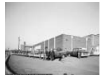
460 Englewood, 1966

The developmental pattern for Boulevard Crossing in the 1960s continues to become increasingly industrial. In the 1960s listings for Englewood first appear in the City Directories. A Potato Processing Plant now occupies 1015 Boulevard while 1047 Boulevard continues to function as the Land Of Plenty Grill. By 1965 Peach State Distributing Company has taken over 1040 Boulevard from the Dayton Tire Company and continues to own the building today. The first listings in the City Directories for