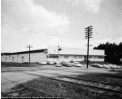
General Tire Co, 1958

Boulevard Crossing continues to see an increase in light industry through 1960 while residential growth slows in this decade. Neighborhood services such as grocery stores and restaurants have a continued presence along Boulevard, however, the number of residences on the blocks directly north and south of the beltline on Boulevard begin to decrease in response to an increase in number of industries. These industries include the General Gas Corporation and Tire and Rubber Company as well as the Dayton