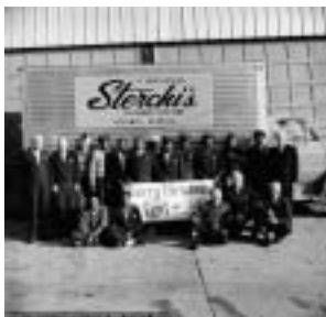
Sterchi's Warehouse, 1967

Rubber Company. At 650 Hamilton the Sterchi Brothers Furniture Warehouse is listed in the City Directory and remains there through the 1980s.