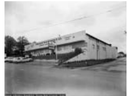
Dayton Rubber Co, 1961

Boulevard Crossing continues to see an increase in light industry through 1960 while residential growth slows in this decade. Neighborhood services such as grocery stores and restaurants have a continued presence along Boulevard, however, the number of residences on the blocks directly north and south of the beltline on Boulevard begin to decrease in response to an increase in number of industries. These industries include the General Gas Corporation and Tire and Rubber Company as well as the Dayton