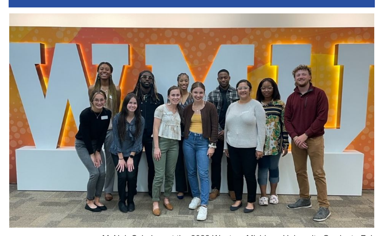
McNair Scholars at the 2022 Western Michigan University Graduate Fair