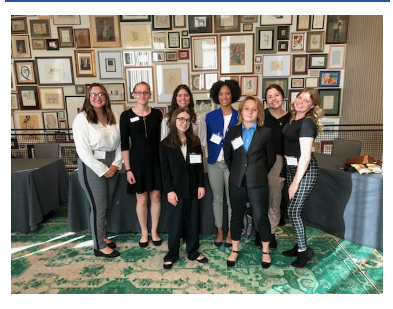
2022 Michigan State University AGEP Student Success Undergraduate Research Conference