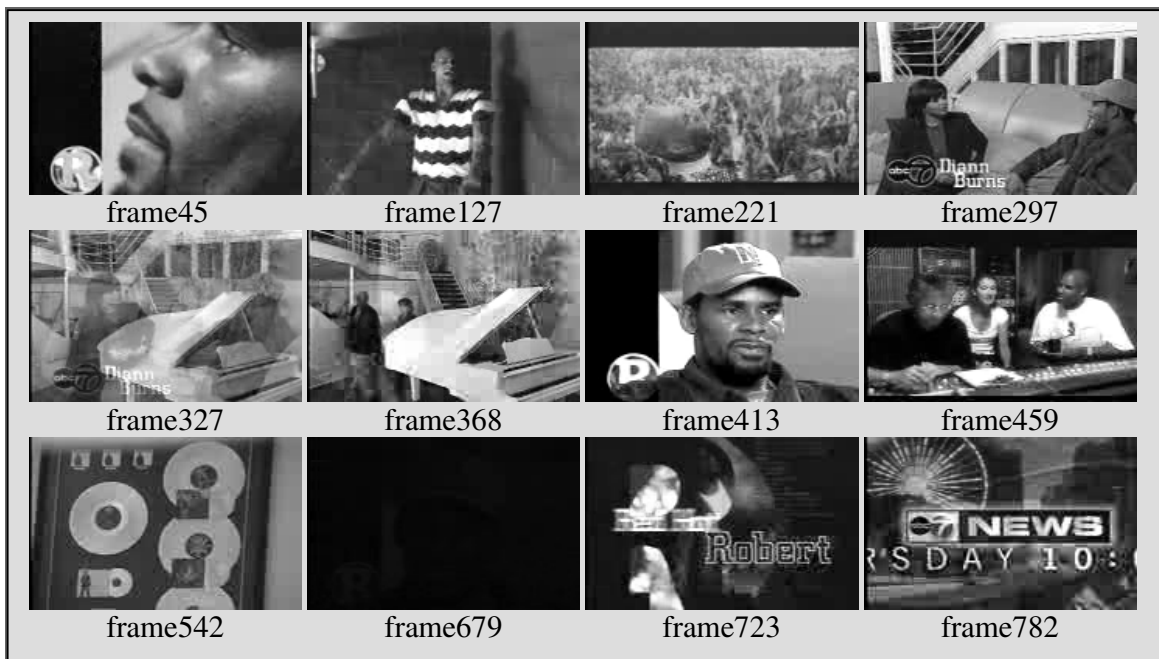
a). The example scene cuts for the ABC 7 NEWS video sequence.