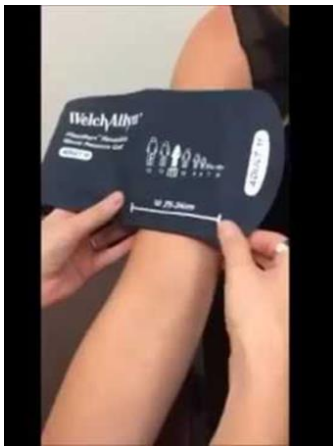
Figure 1: Recommended cuff sizes