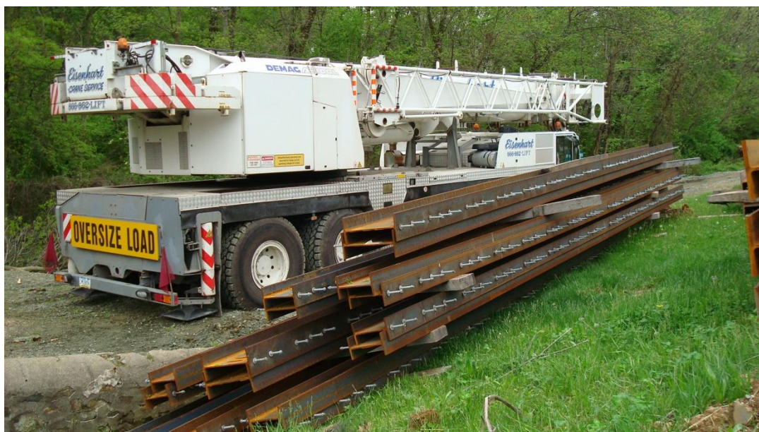
The steel for the temporary support frame, together with the crane, arrives on-site in early May 2009