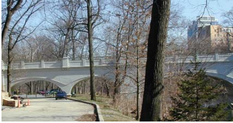
RMC participants take a bus tour to recently completed I-95 bridge over the Brandywine Creek.

Hill Road in Claymont. DelDOT or consultant project staff were stationed at all the locations to explain projects in detail and to answer questions.