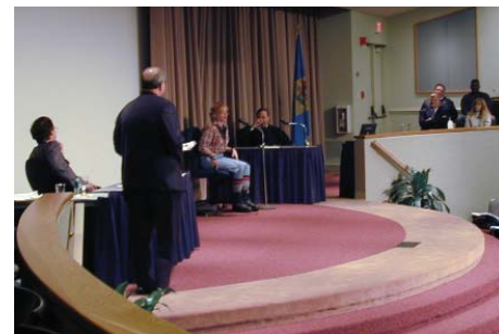
A mock trial involving a work zone fatal accident.

A new feature this year was a bus tour to active and recently completed highway projects in the Wilmington area. Four buses went on a round robin tour of the River Front Walk, the I-95 bridge over the Brandywine Creek, the US