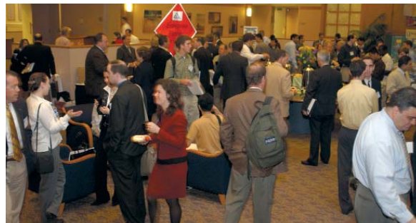
Attendees view the exhibits at the Transportation Research and Education Forum.