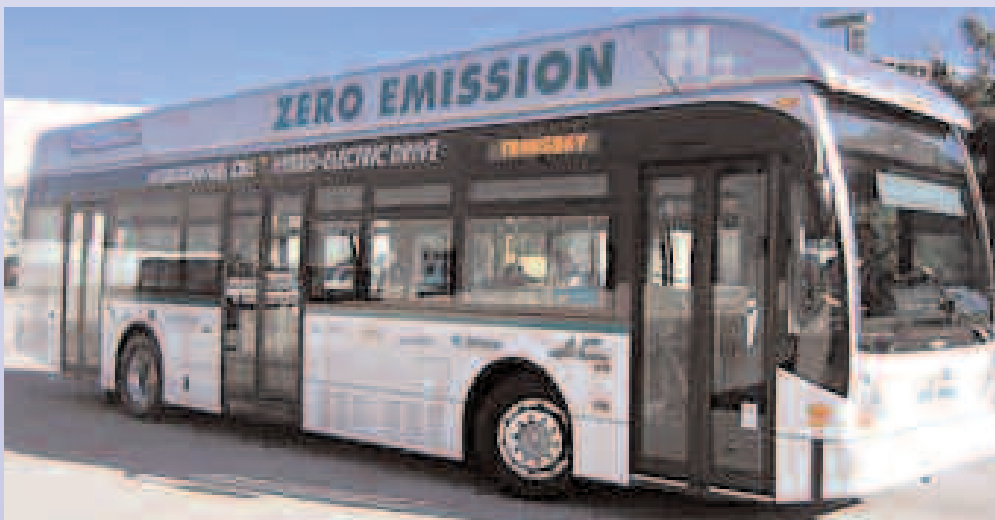
Prototype Fuel Cell Bus

President Bush signed a six-year, $286.4 billion federal transportation bill into law in August, returning federal gasoline tax revenue to states for road construction and public transportation. The bill contains money for universities, including $2 million for the University of Delaware for a federally designated transportation research program. These funds will be used for research on transportation issues and opportunities in the region and nation, including providing research data to government and other transportation agencies. The money will also be used to continue and enhance the University's top-notch transportation-related education programs. A Technical and Scientific Advisory Group (TSAG) consisting of University of Delaware faculty and research staff, as well as other prominent national and international transportation professionals, will be assembled to oversee the operation of this program. The research will address rail, surface, air, and water transportation, including complex issues such as air quality, safety, security, and pollution. The University of Delaware is one of 22 colleges and universities nationally to receive Tier II UTC grants.