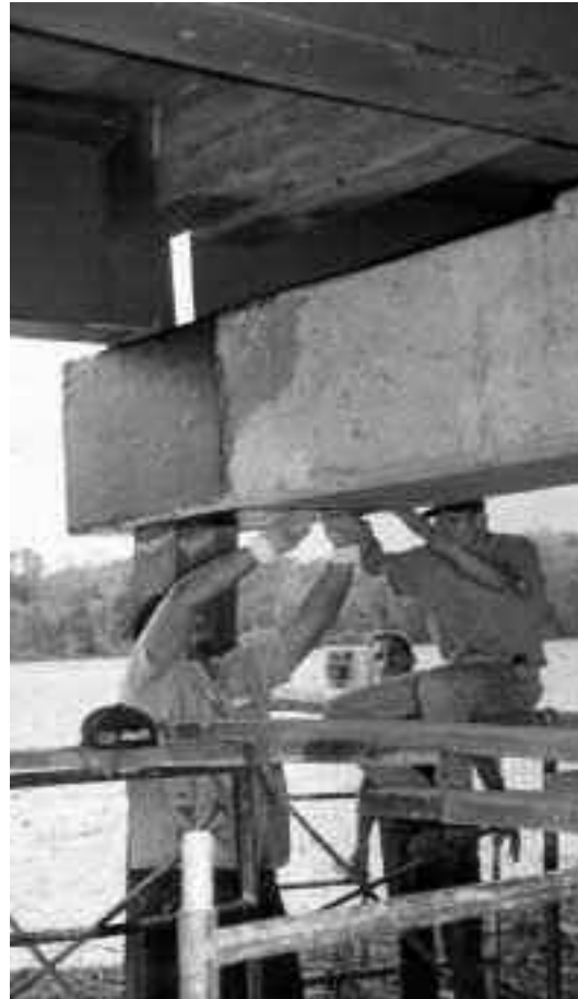
Carbon Fiber Fabric, SR 2 application.

The Georgia DOT Maintenance Office estimates that carbon fiber can be used on 20 bridges per year in Georgia. This strategy could save approximately $5 million per year, based on estimated replacement costs versus carbon fiber repair costs and assuming an average extended bridge life of 20 years.