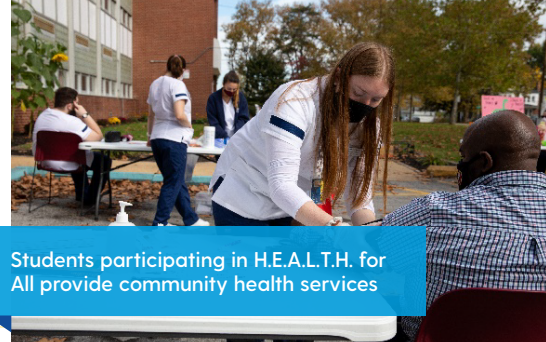
Students participating in H.E.A.L.T.H. for All provide community health services

PHC has been coordinating interdisciplinary research, evaluation, and service partnerships across the state to support communities, systems, and sectors in advancing health and well-being. An excerpt of activities from our response to COVID-19 are shining examples of this commitment: