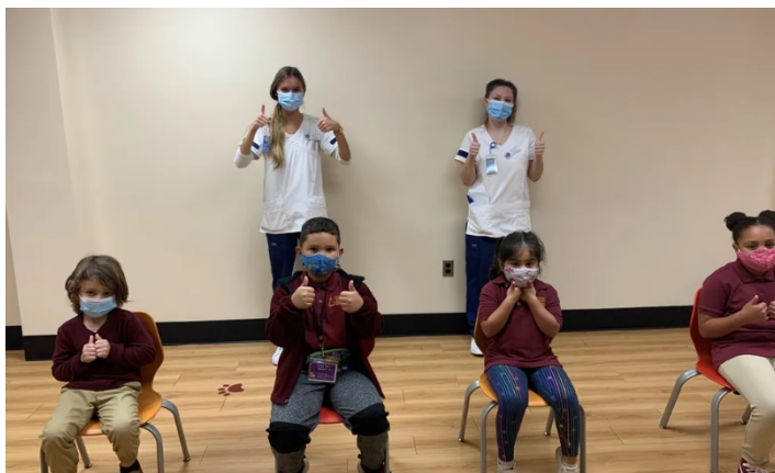
UD Nursing students work with students to create health education videos for their families and school.

H.E.A.L.T.H. for All , a partnership between Highmark Blue Cross Blue Shield Delaware, Lt. Governor's Challenge, and PHC, currently collaborates with 3 schools, 4 community centers, 2 churches, 1 senior center, and 1 homeless shelter. Among the 56% of community partners who completed an evaluation, 100% indicated they would like to continue to partner in the future because it, "meets community needs," is, "visible and accessible," and, "provides convenient access to care to residents and areas of the community that might not otherwise have it." This interdisciplinary program has also engaged faculty and over 250 students from disciplines and courses of study at 2 UD colleges and 6 departments to create a platform for interprofessional workforce development and community-engaged scholarship for health. Learn more at www.healthforallde.org .