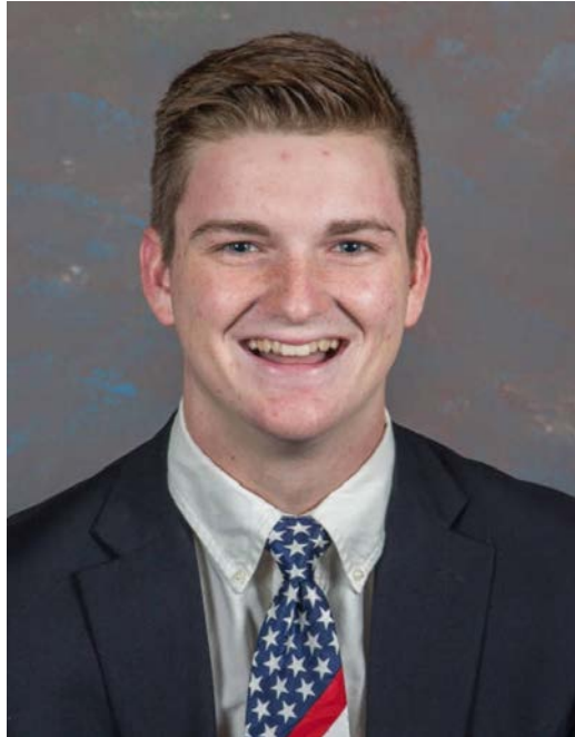
Senior Men's Lacrosse Major: Business Management President Student Athlete Advisory Committee Athletic Representative: Council of Student Leaders