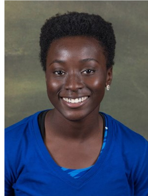
Senior Women's Track & Field Major: Human Services Resident Assistant, Smyth Hall Blue Hen Ambassador Tour Guide NSO Orientation Leader